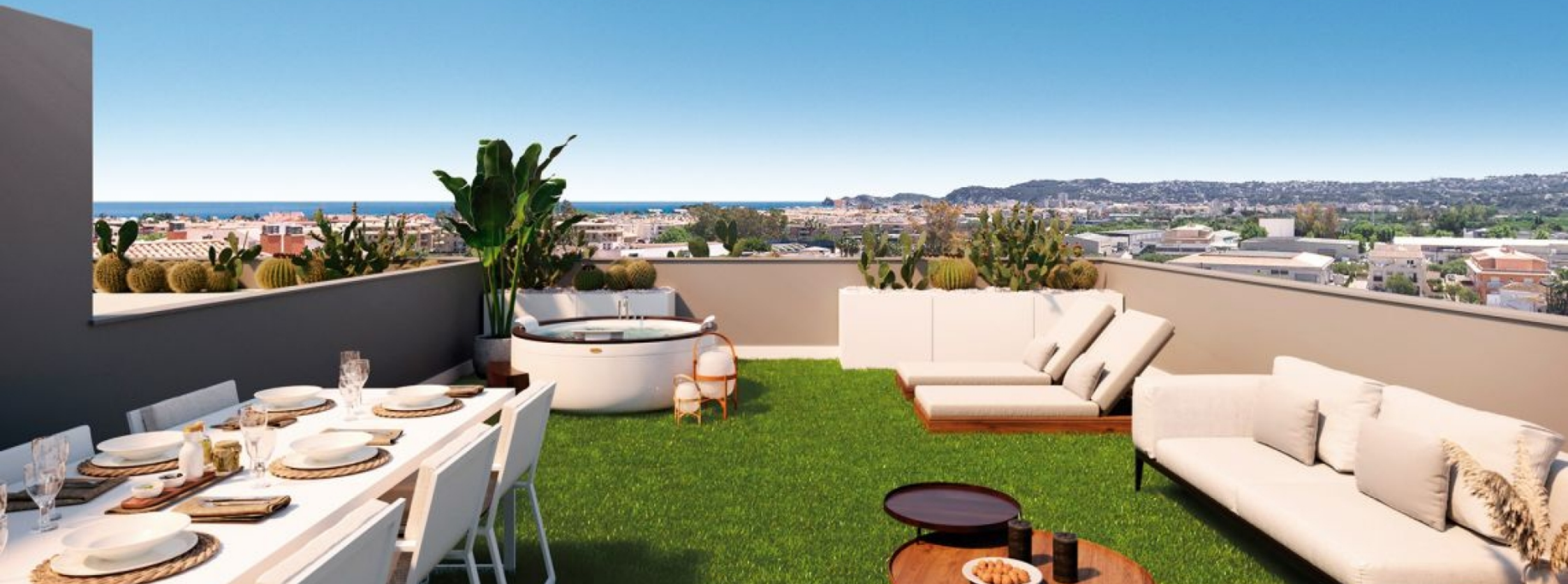
Neue Wohnanlage Essencial Jávea, Wohnung im ersten Stock in neuer Konstruktion. ALTSTADTZENTRUM, JÁVEA/XÀBIA - REF. EB1-6