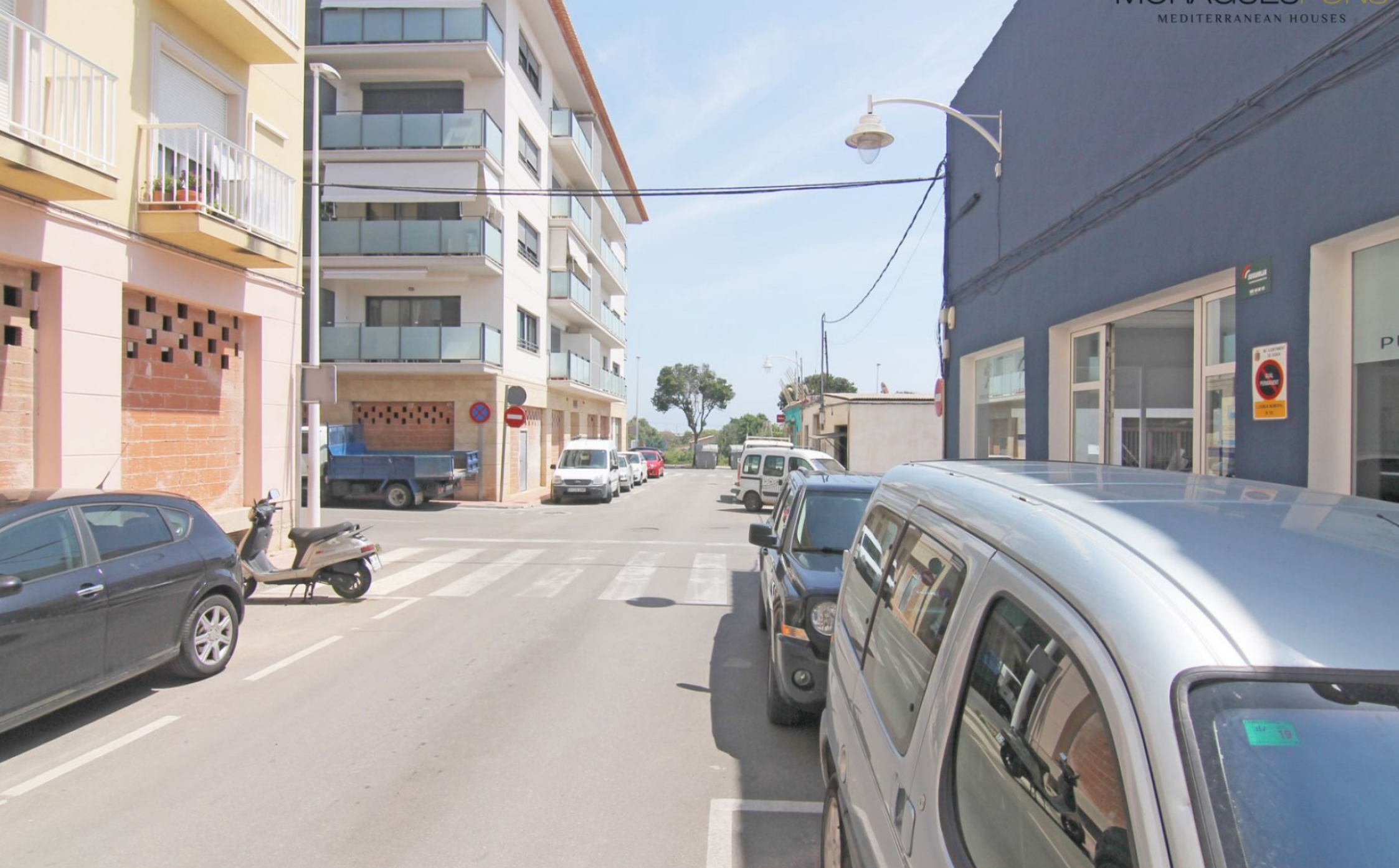
Parkplatz in der Calle Sandoval ALTSTADTZENTRUM, JÀVEA/XÀBIA - REF. P-214