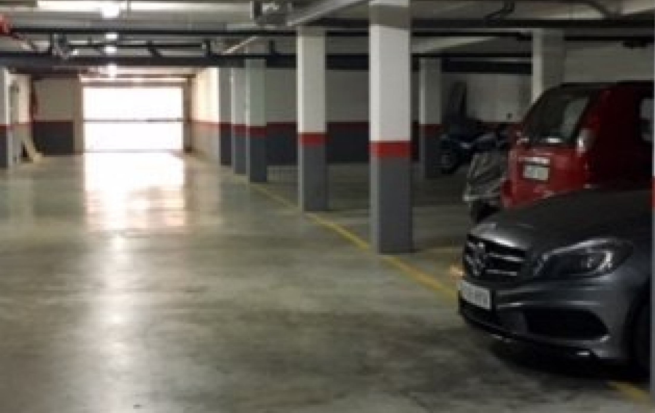
Car park for sale in urbanization Masia el Arenal MONTAÑAR - EL ARENAL, JÁVEA/XÀBIA - REF. P-201