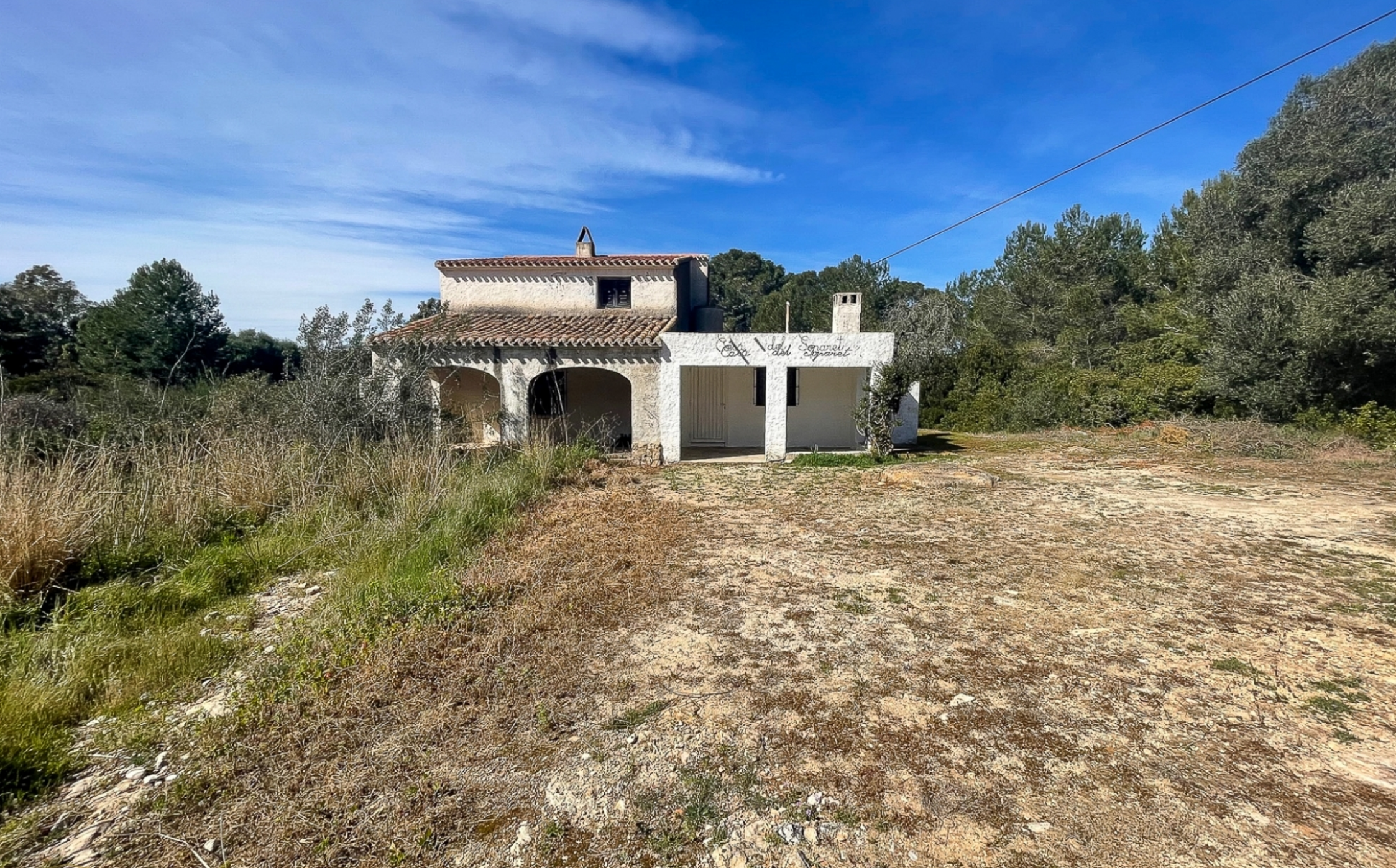
Country house for renovation in Portichol in Jávea BALCÓN AL MAR - PORTICHOL, JÁVEA/XÀBIA - REF. V-481