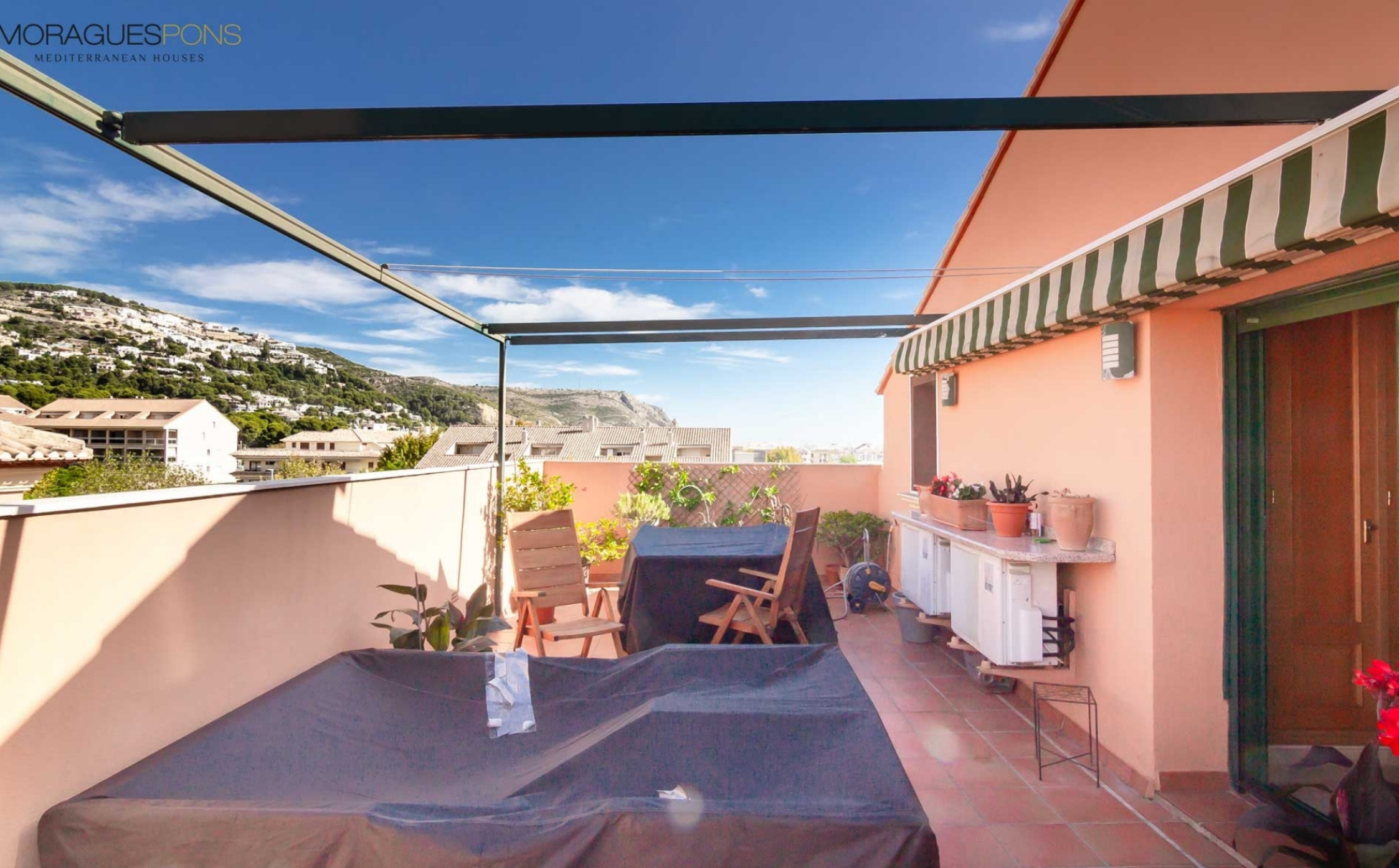
Duplex penthouse in Jávea Port