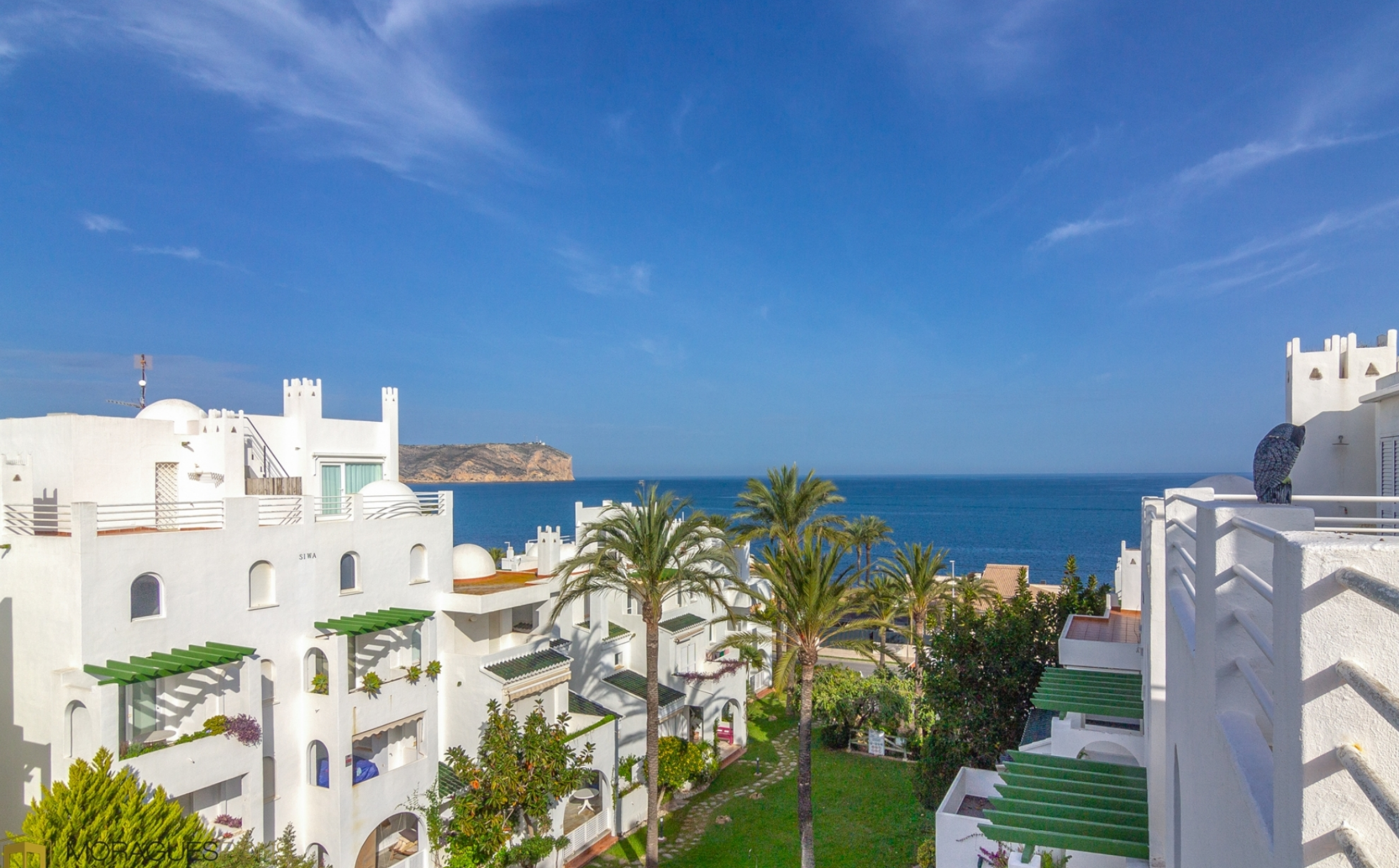
Duplex penthouse in the second Montañar of Jávea MONTAÑAR - EL ARENAL, JÁVEA/XÀBIA - REF. A-453