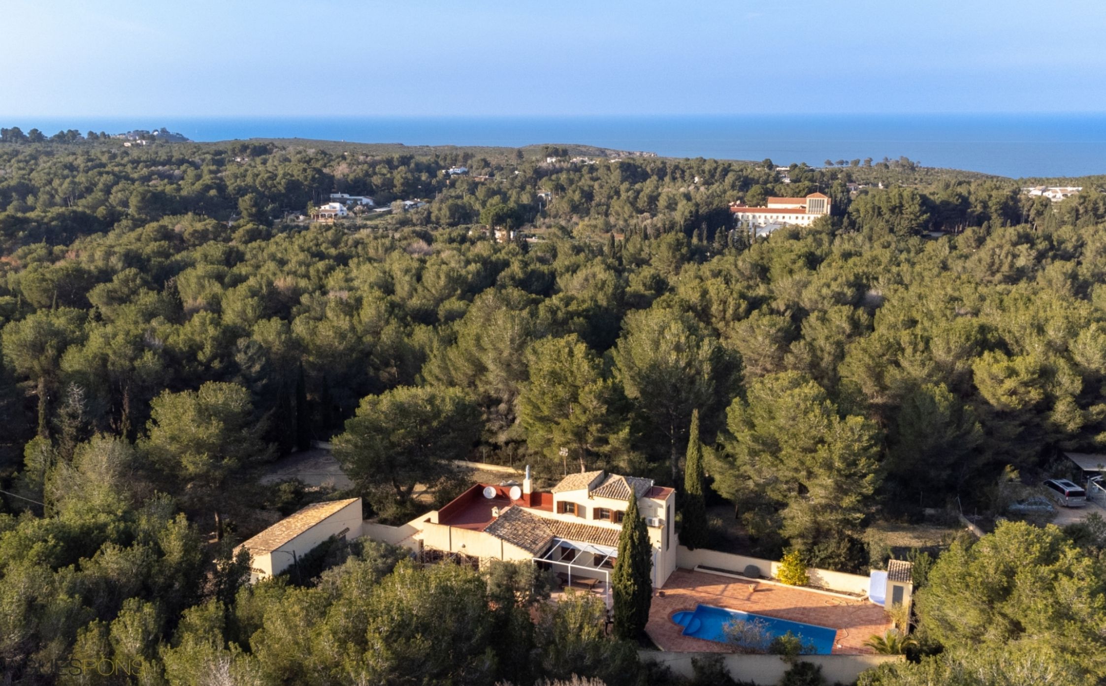
Fabulous country house in Las Planas, Jávea. CUESTA SAN ANTONIO - PUCHOL, JÁVEA/XÀBIA - REF. V-448