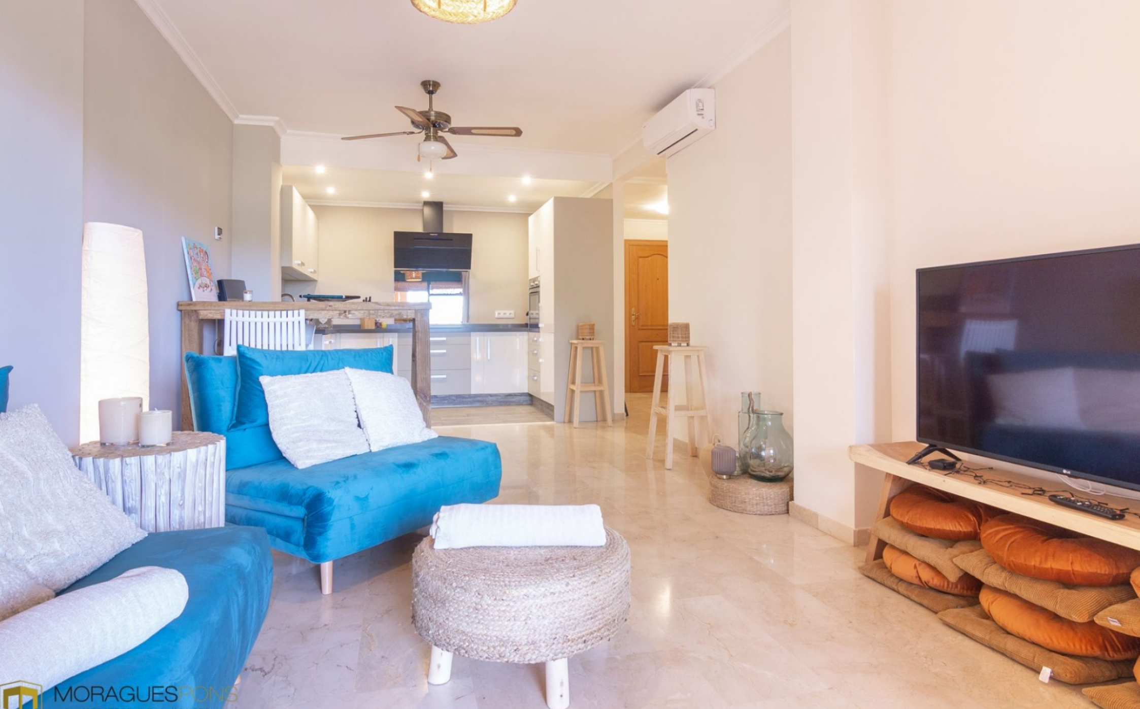
Flat for sale in Jávea Port PORT, JÁVEA/XÀBIA - REF. A-350