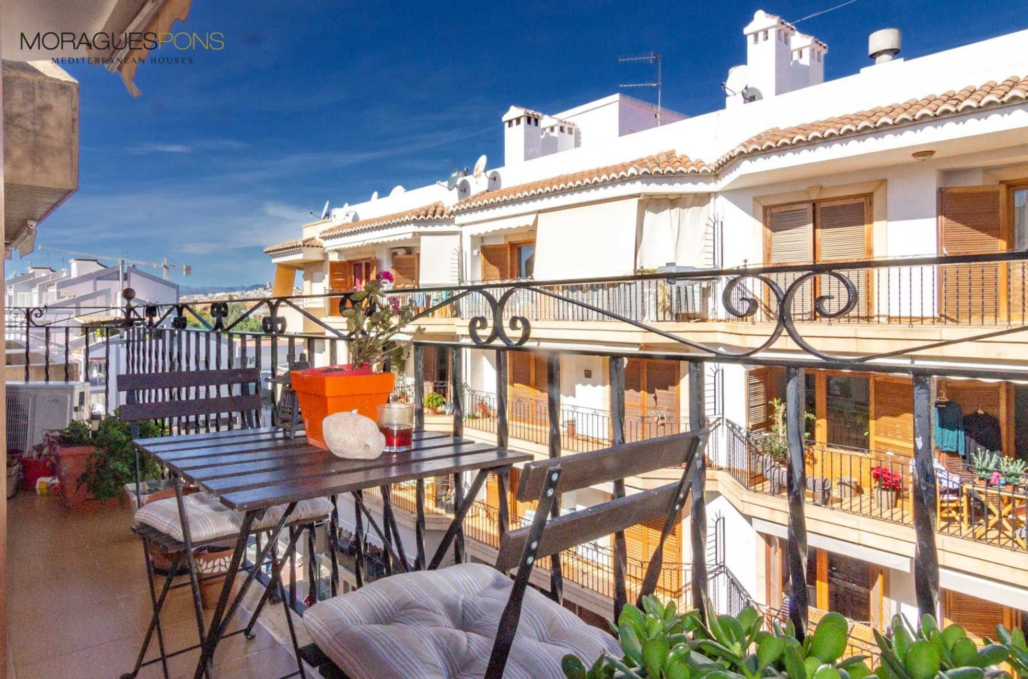
Flat in the heart of Jávea Port PORT, JÁVEA/XÀBIA - REF. A-351