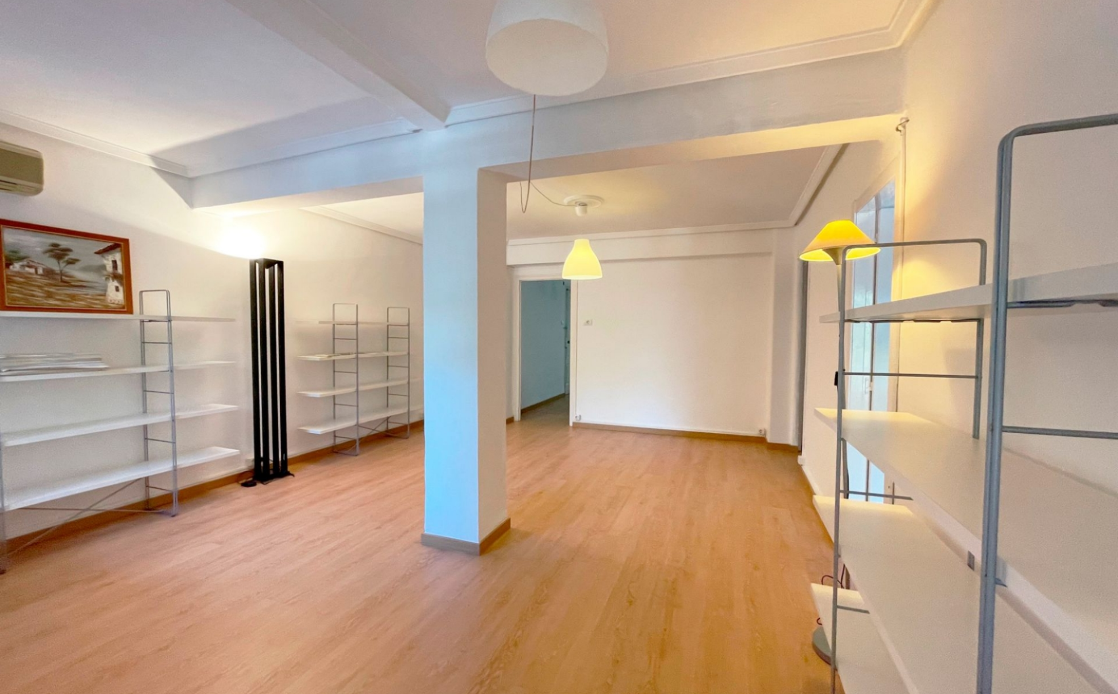
Flat in the port of Jávea PORT, JÁVEA/XÀBIA - REF. A-318