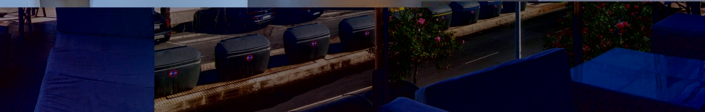
Flat on the Arenal beach of Jávea MONTAÑAR - EL ARENAL, JÁVEA/XÀBIA - REF. A-367