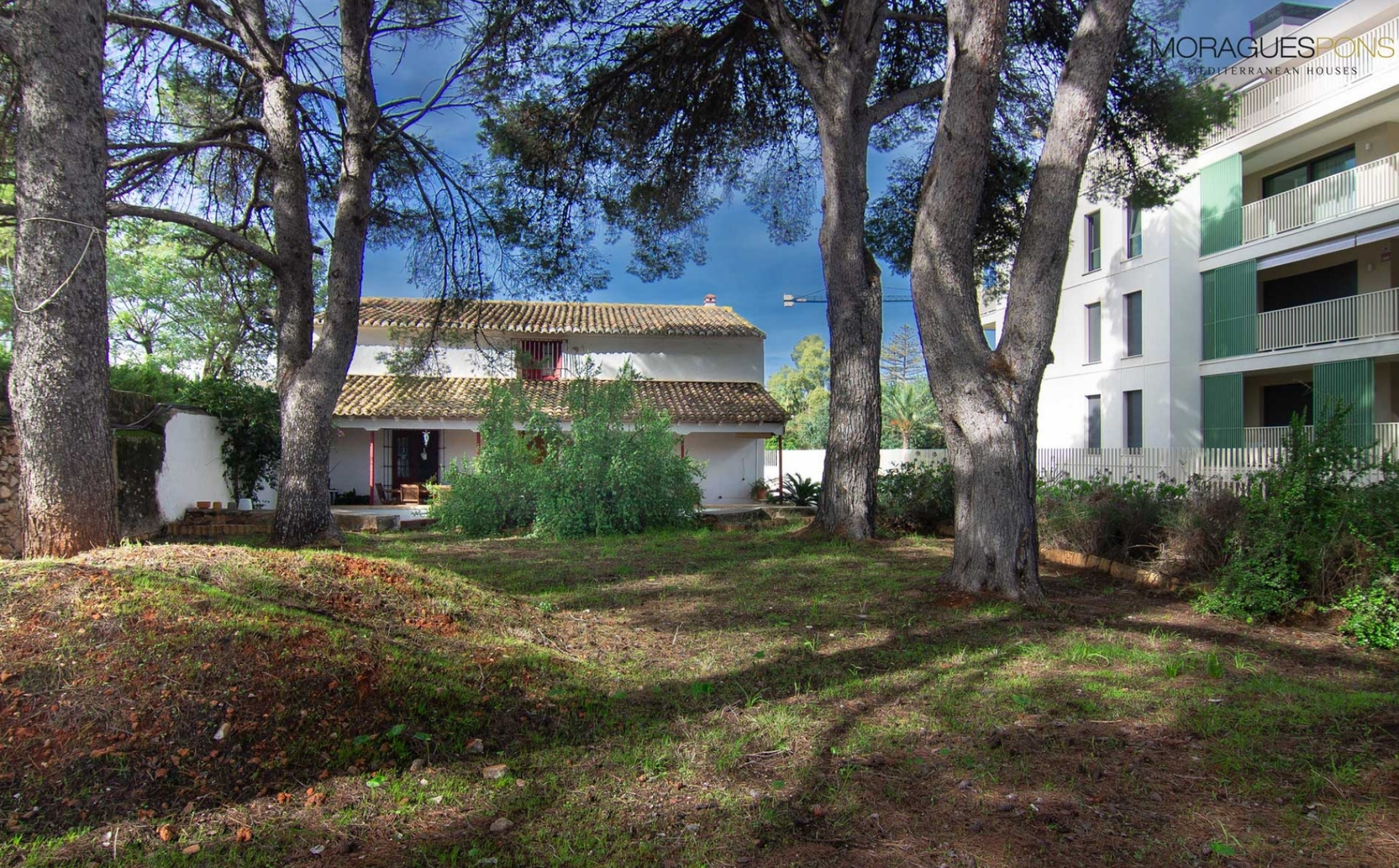
Genuine house in the heart of Denia, close to the Port and the beach of La Marineta Casiana DÉNIA - REF. V-515