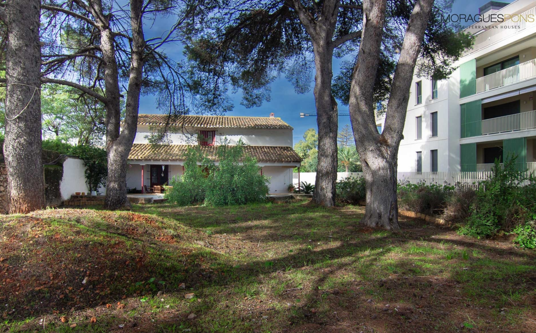
Genuine house in the heart of Denia, close to the Port and the beach of La Marineta Casiana DÉNIA - REF. V-515