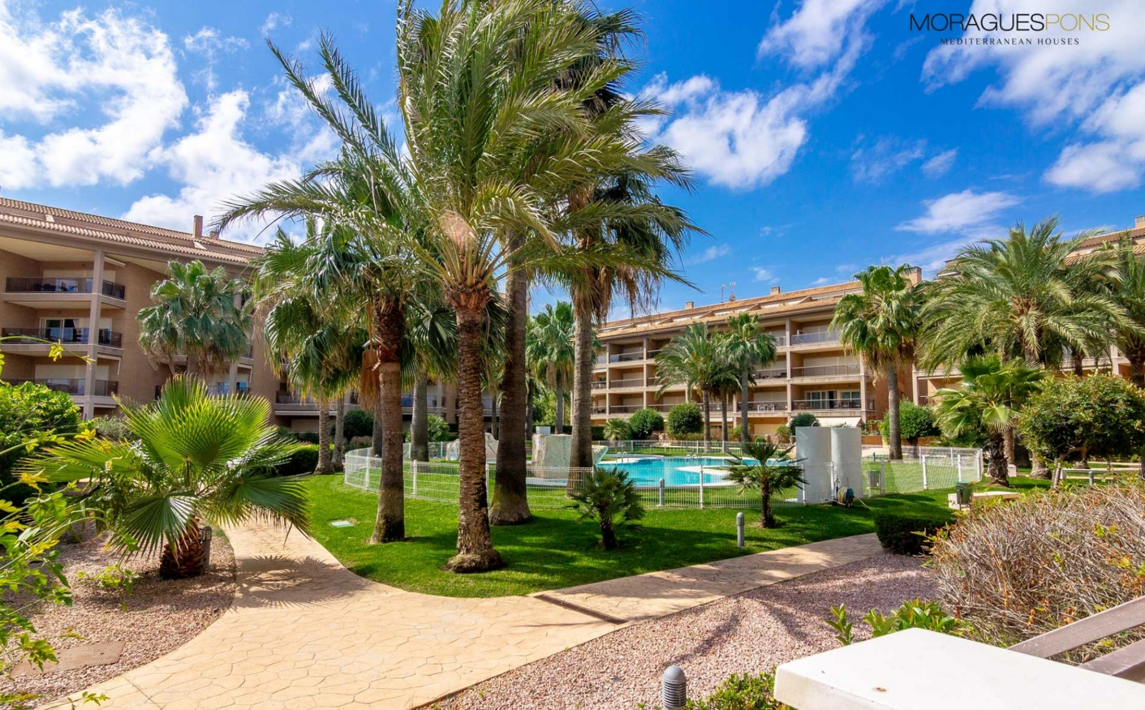
Ground floor apartment on the Arenal beach in Jávea. MONTAÑAR - EL ARENAL, JÁVEA/XÀBIA - REF. A-422