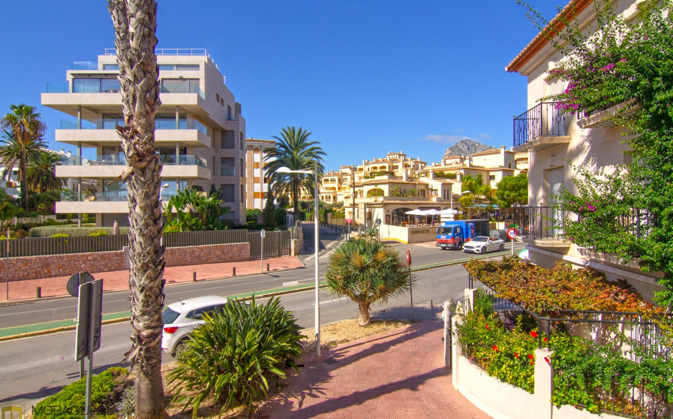
House for sale in the port of Jávea PORT, JÁVEA/XÀBIA - REF. V-510