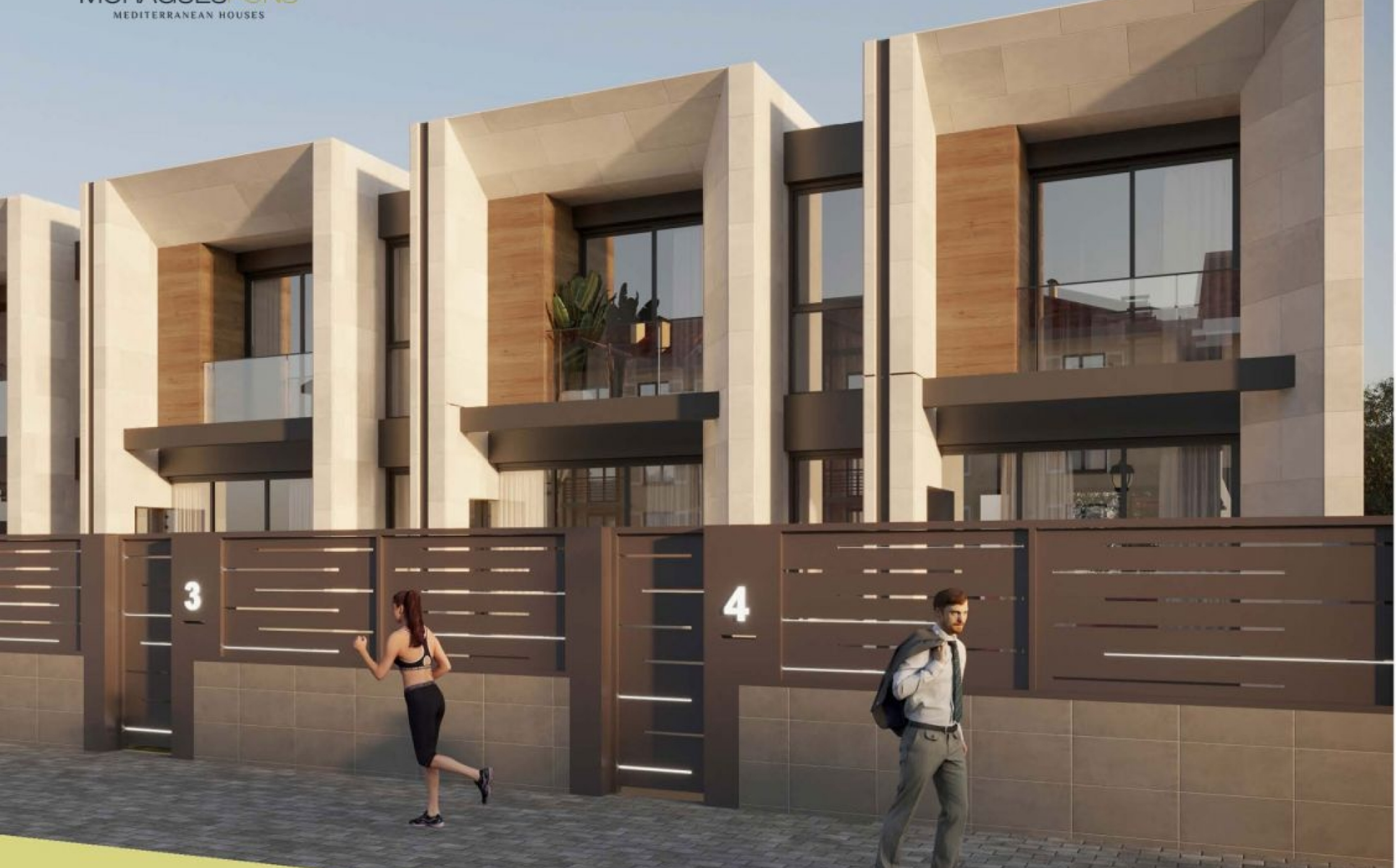
House with private pool in Gata de Gorgos GATA DE GORGOS - REF. NATURE 8