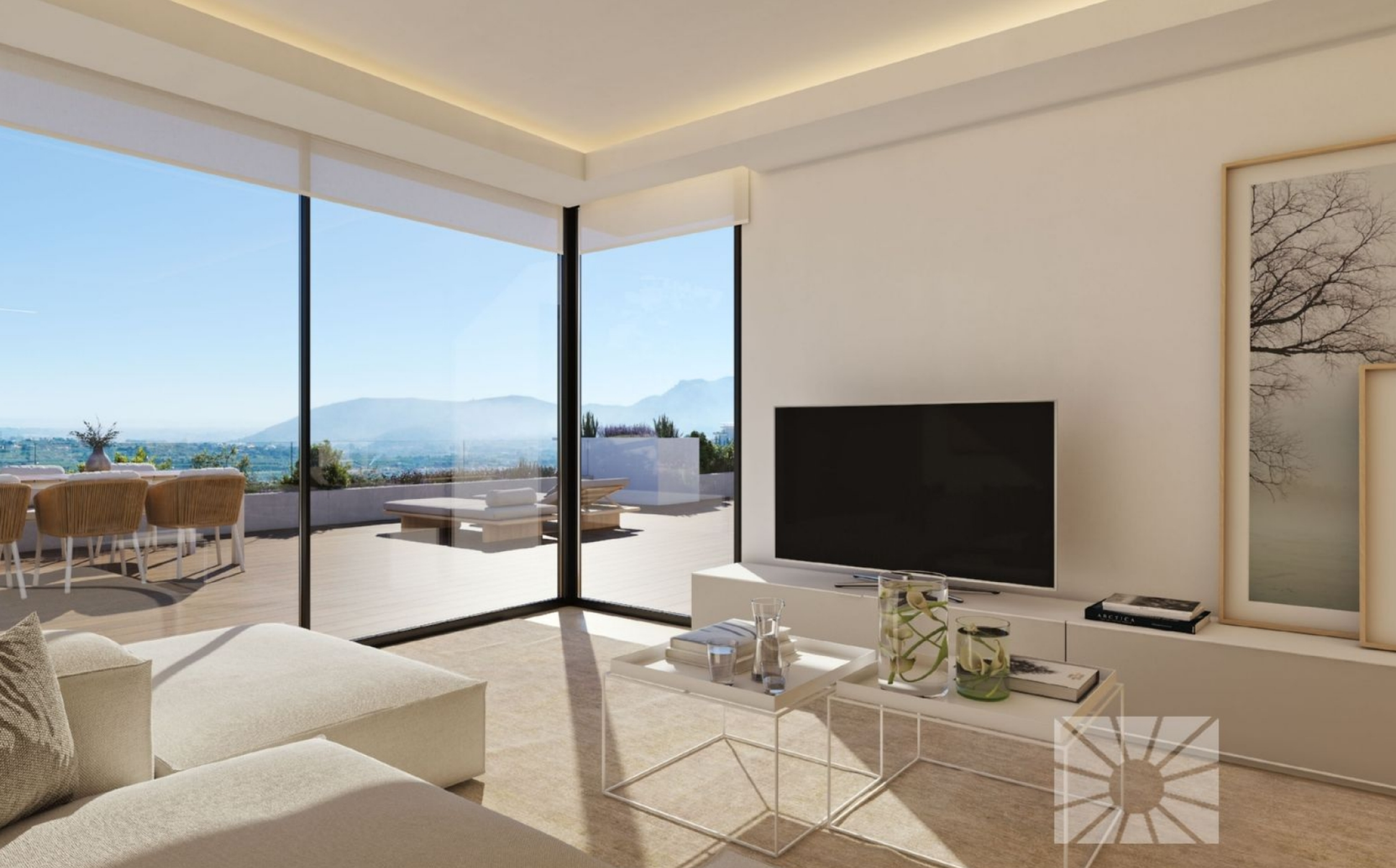
Luxury home in La Sella next to the Mediterranean Sea PEDREGUER - REF. OV-DBA01