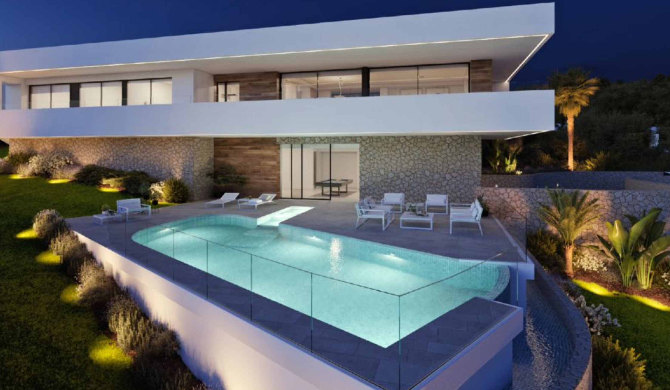
Luxury villa with sea views in Cumbre del Sol POBLE NOU DE BENITATXELL - REF. OV-AJ063