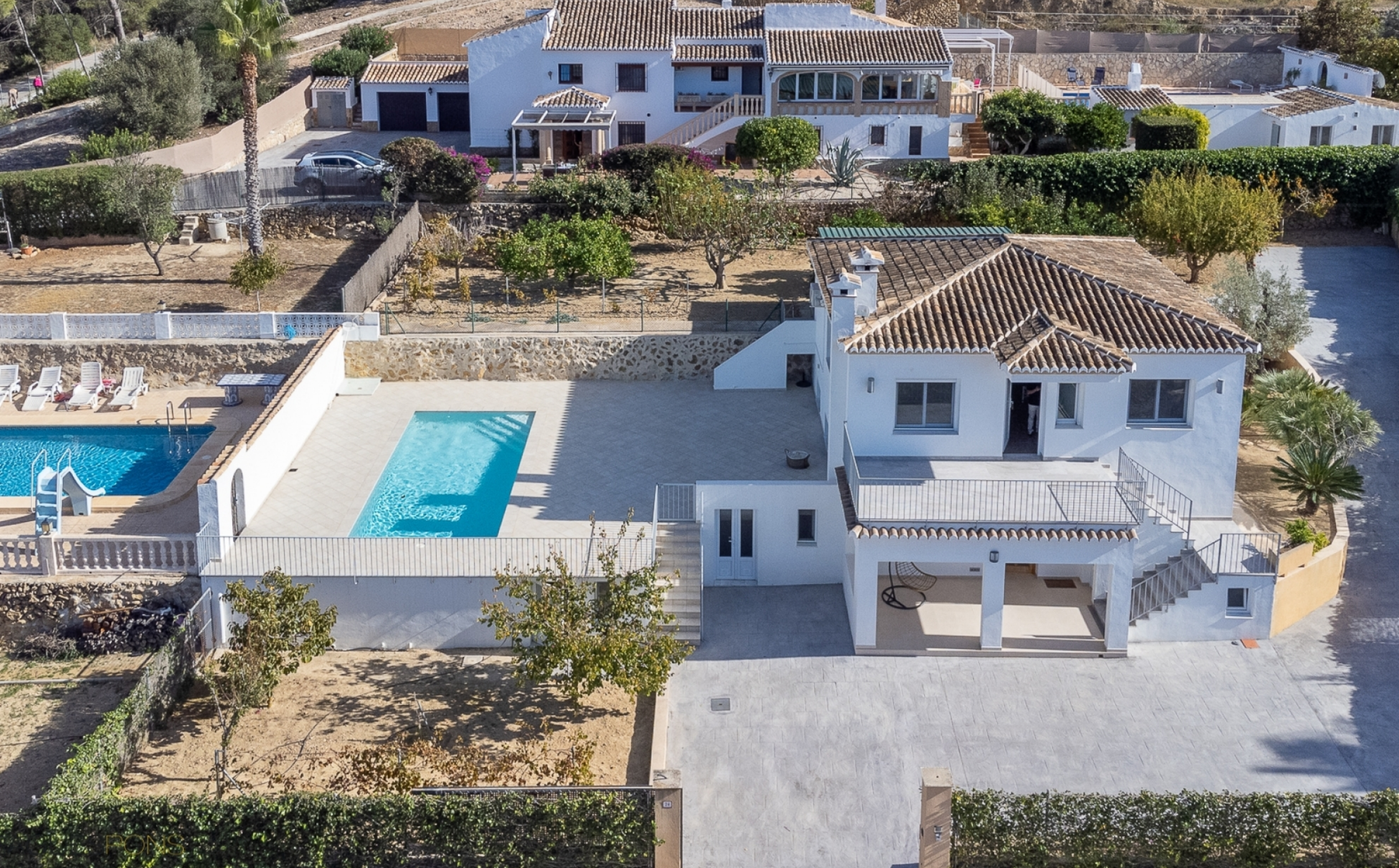
Mediterranean villa with pool and open views in Jávea PARTIDA COMUNES - ADSUBIA, JÁVEA/XÀBIA - REF. V-406