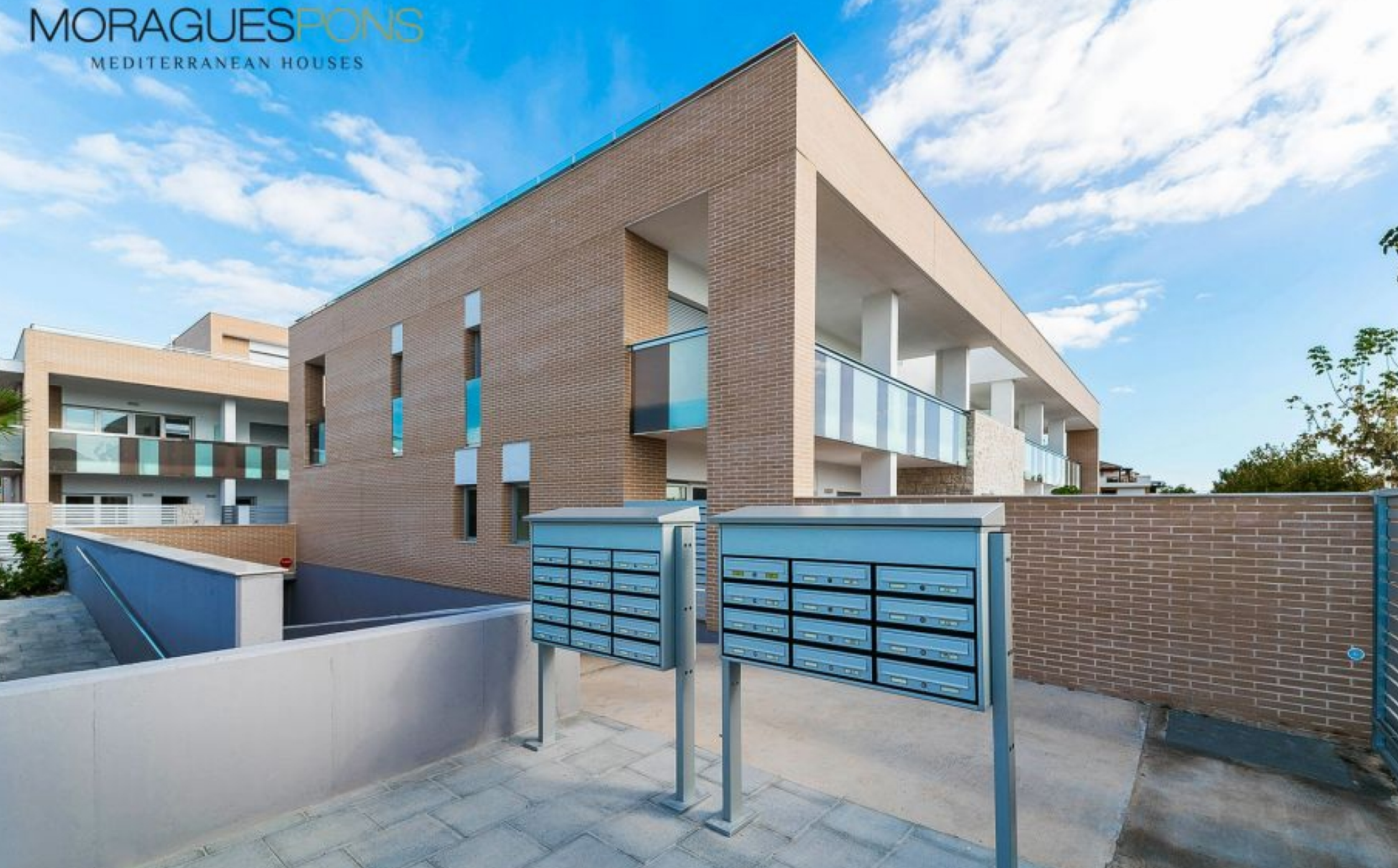
New build ground floor next to the port of Javea OLD TOWN CENTER, JÁVEA/XÀBIA - REF. IV-B1