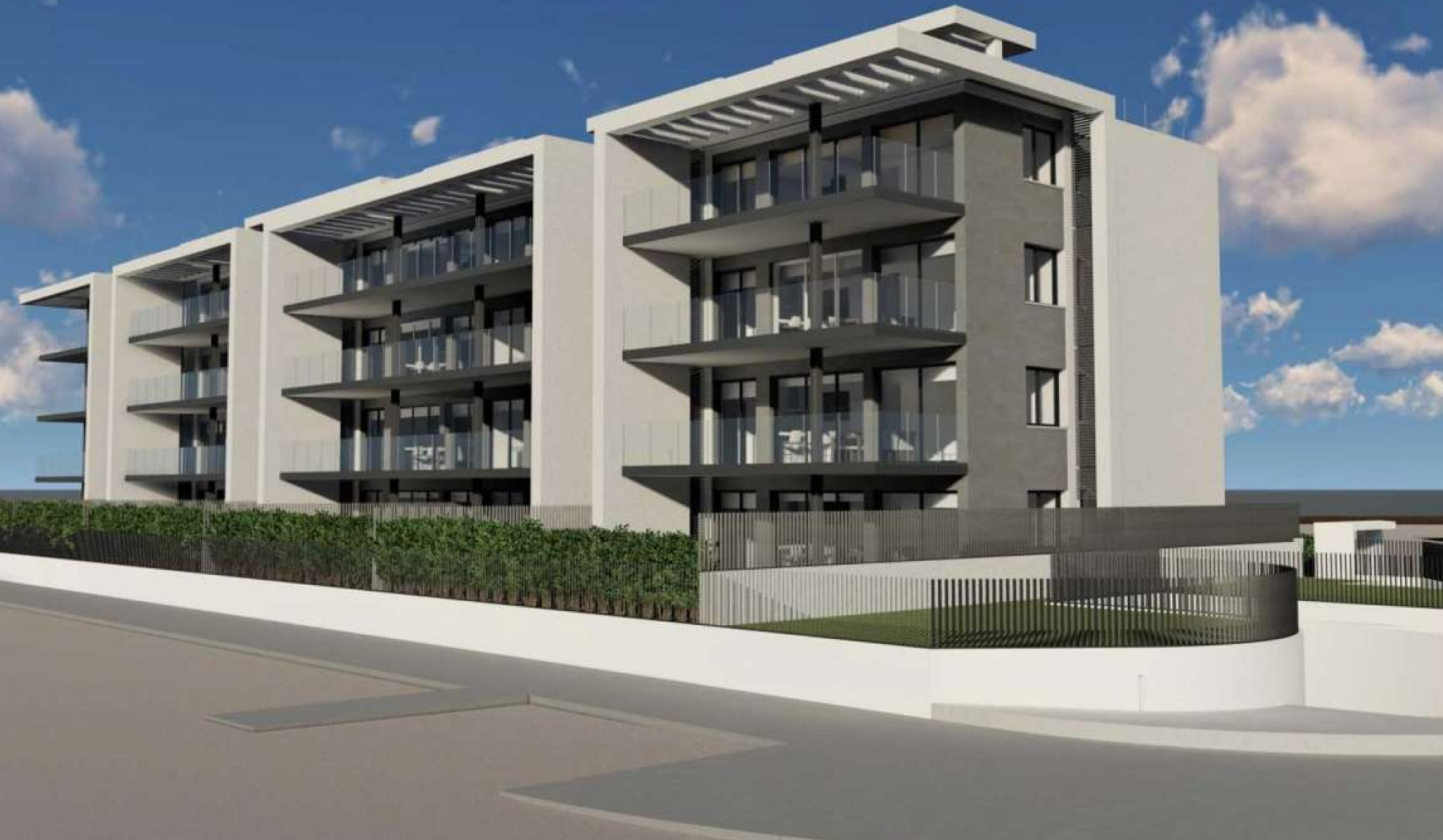
New construction ground floor under construction on the arenal beach of Jávea MONTAÑAR - EL ARENAL, JÁVEA/XÀBIA - REF. B0-A