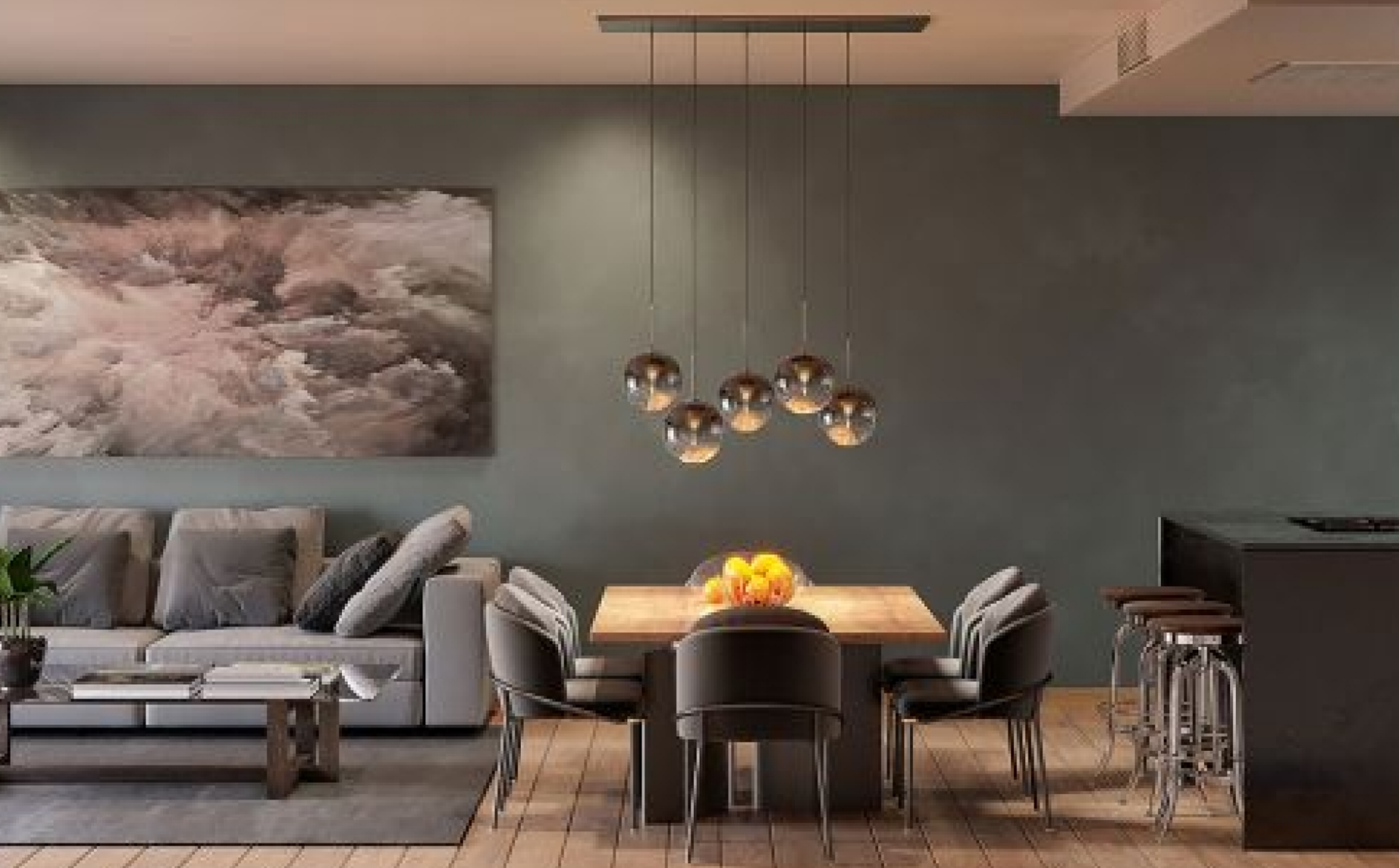
Newly built flat with swimming pool in the port of Jávea PORT, JÁVEA/XÀBIA - REF. PRIME2B