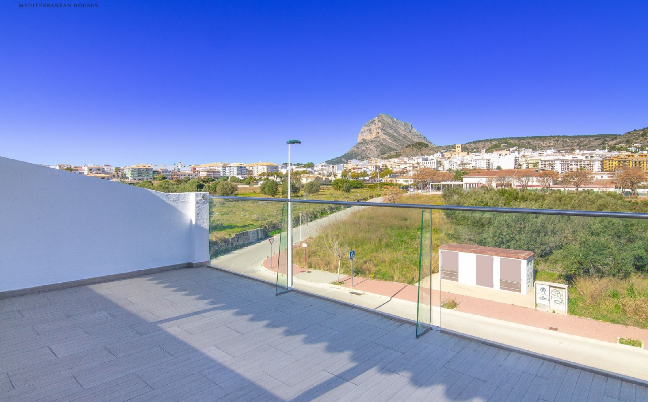
Newly finished townhouses in Jávea. OLD TOWN CENTER, JÁVEA/XÀBIA - REF. VR-4