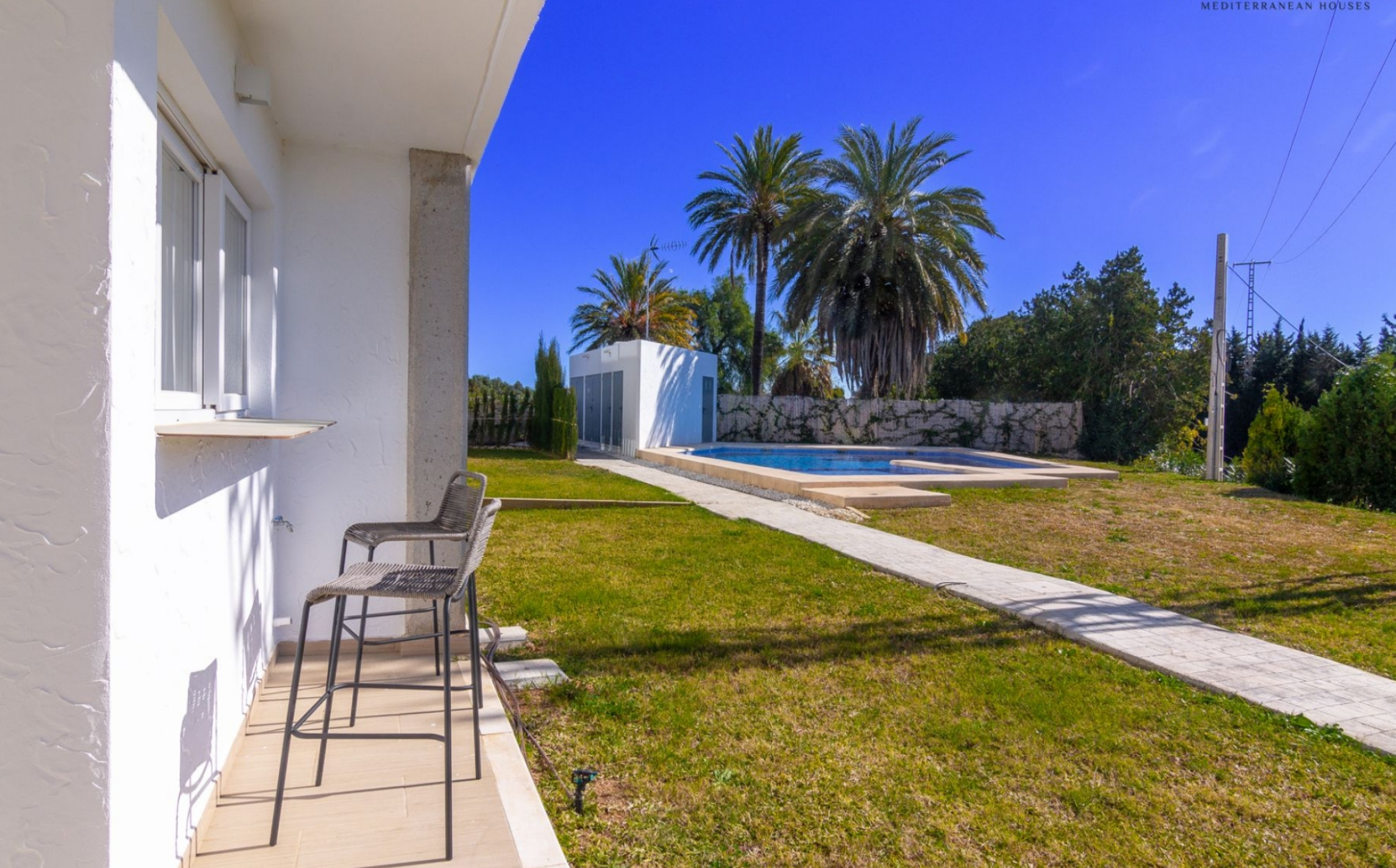
Newly finished townhouses in Jávea. OLD TOWN CENTER, JÁVEA/XÀBIA - REF. VR-6