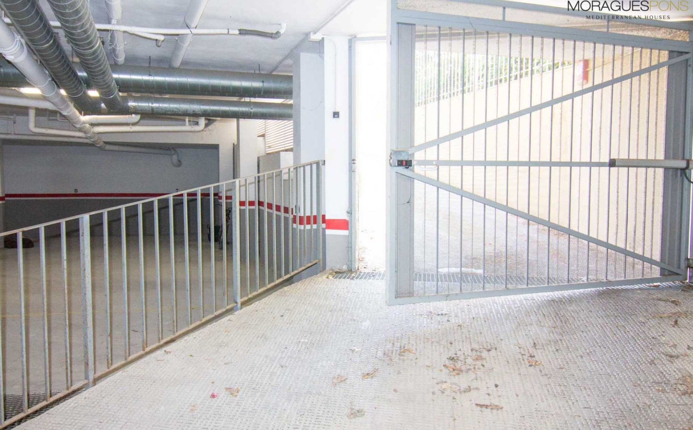
Parking spaces for sale in Javea PORT, JÁVEA/XÀBIA - REF. P-200