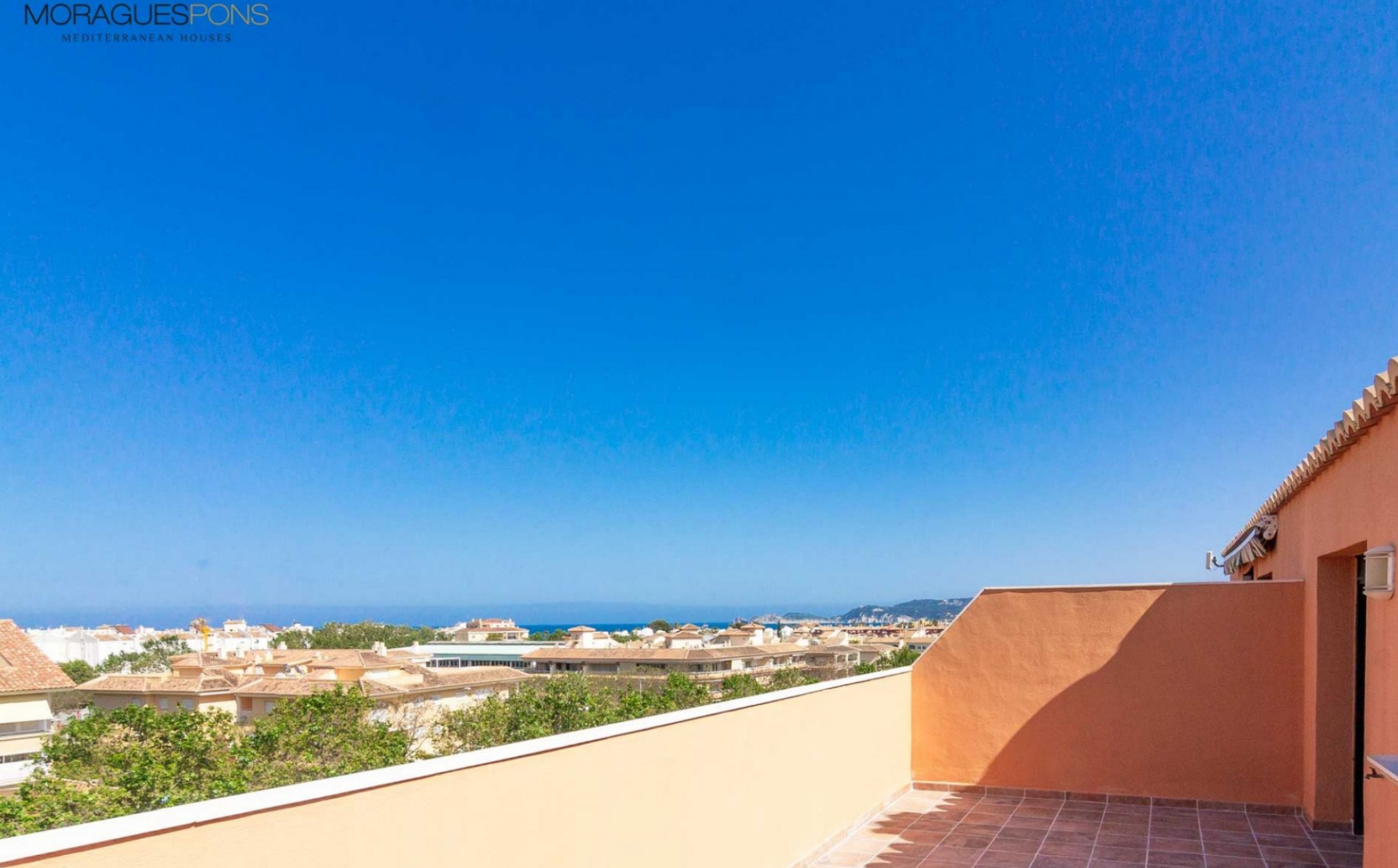
Penthouse in the port of Jávea PORT, JÁVEA/XÀBIA - REF. A-336