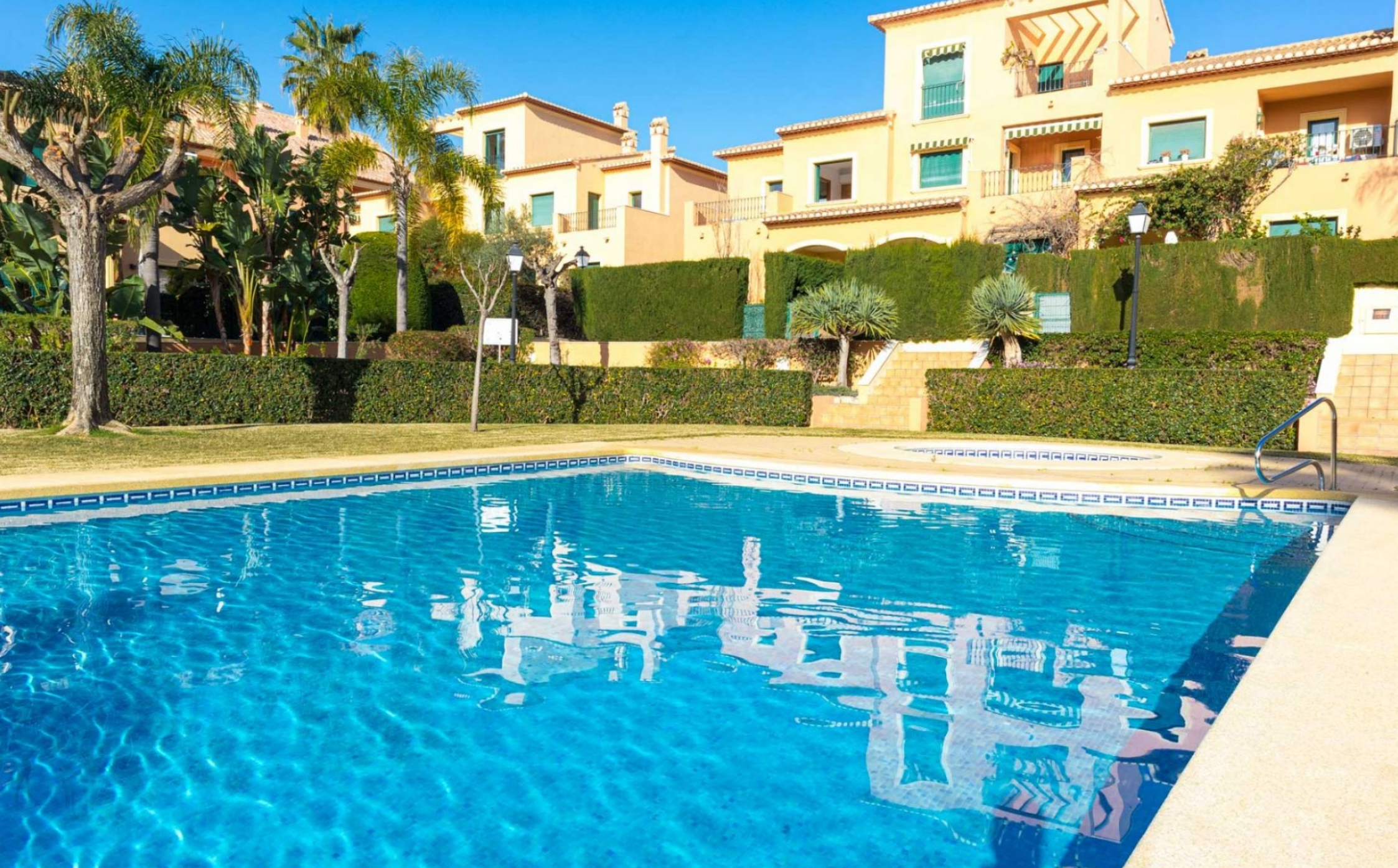
Penthouse with pool in Jávea port PORT, JÁVEA/XÀBIA - REF. A-360