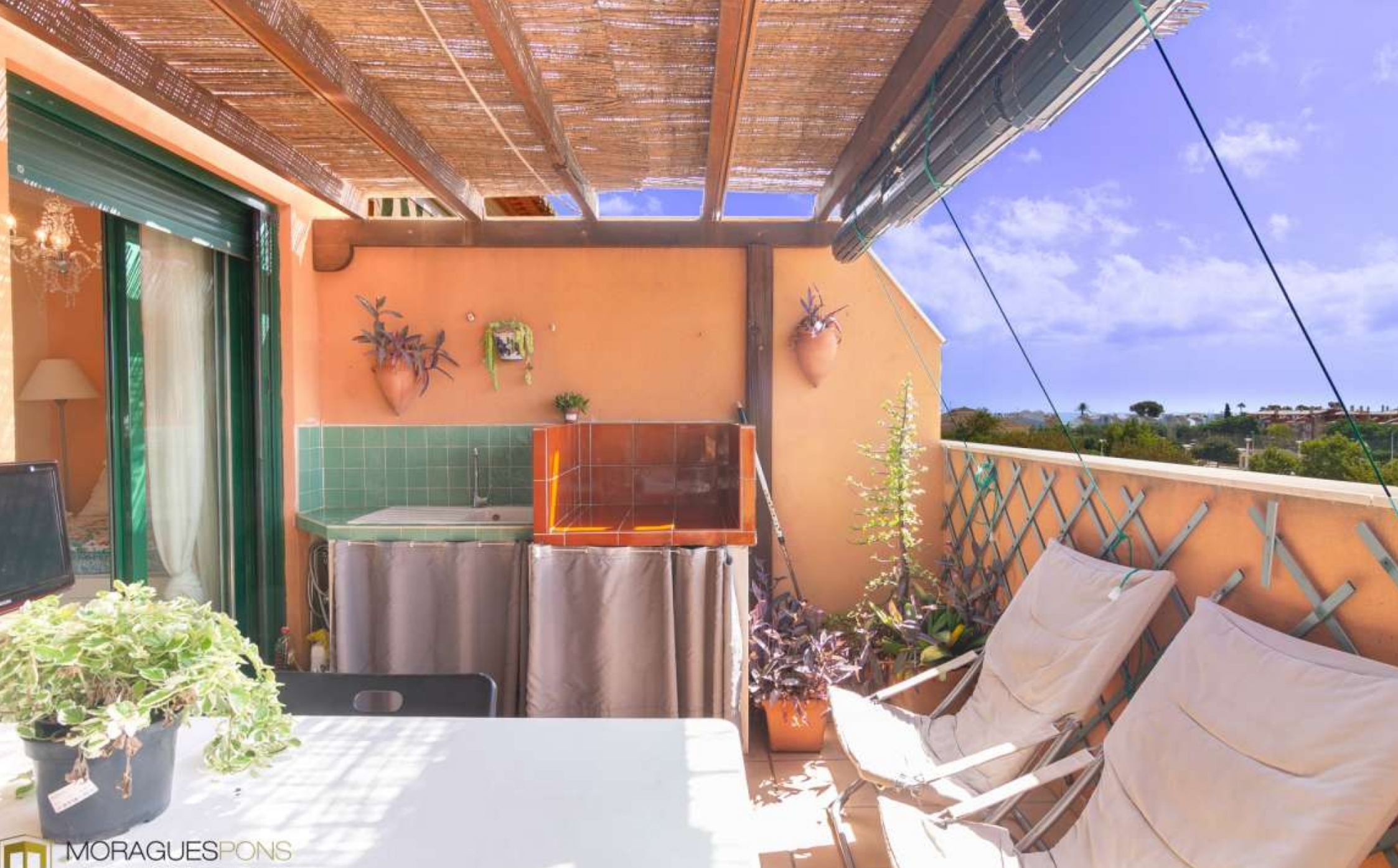
Penthouse with terrace in the port of Jávea PORT, JÁVEA/XÀBIA - REF. A-358