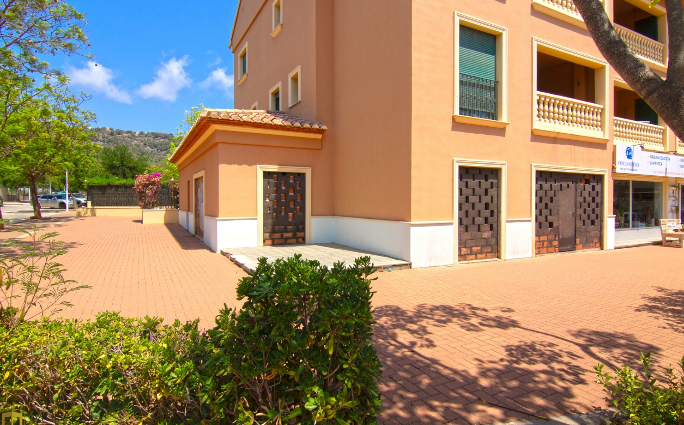
Premises for sale in the port of Jávea PORT, JÁVEA/XÀBIA - REF. LC-112