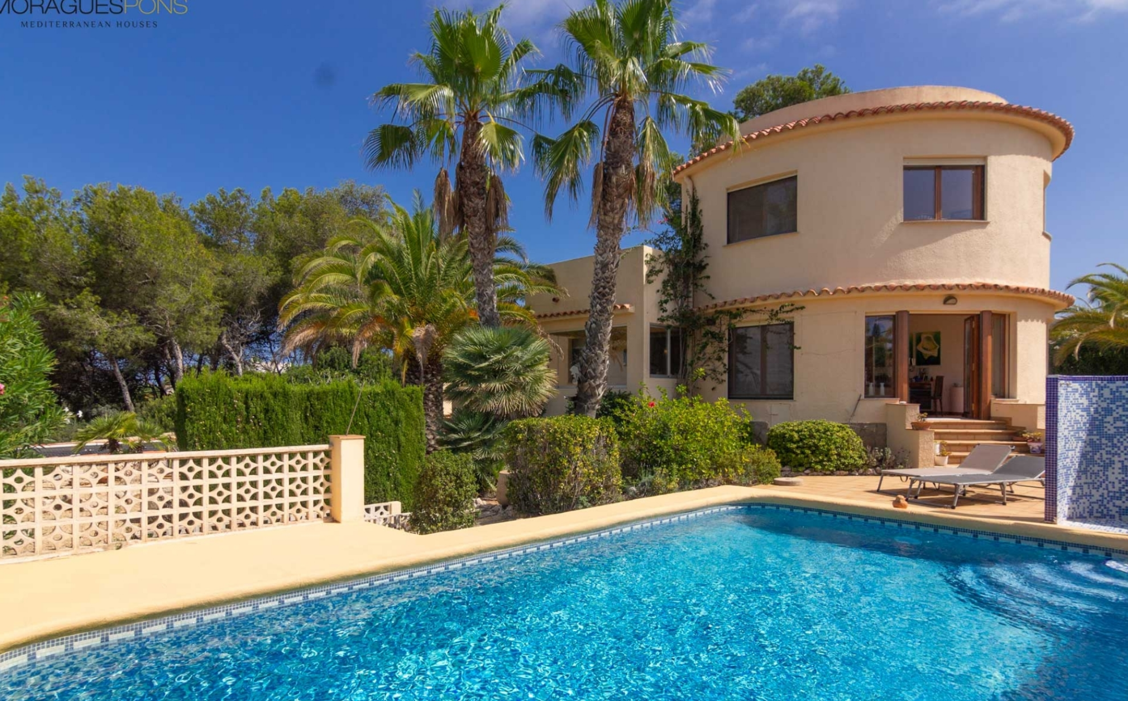
The perfect house in Javea, in Balcón al Mar BALCÓN AL MAR - PORTICHOL, JÁVEA/XÀBIA - REF. V-491