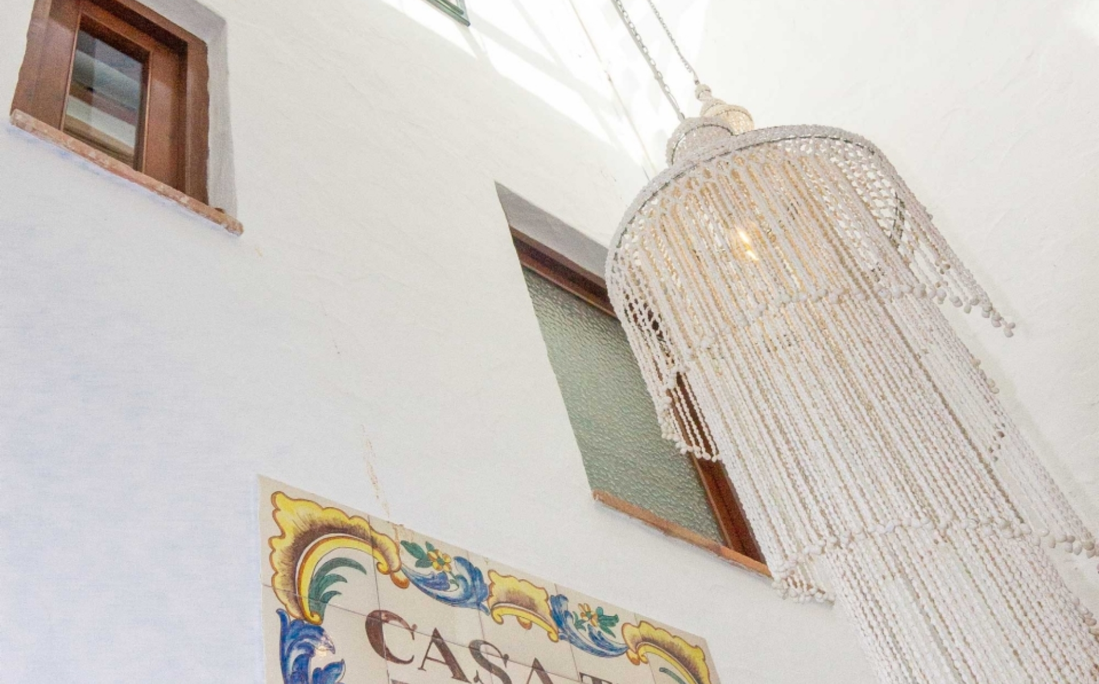
Townhouse in Jávea exclusively with MORAGUESPONS OLD TOWN CENTER, JÁVEA/XÀBIA - REF. V-475