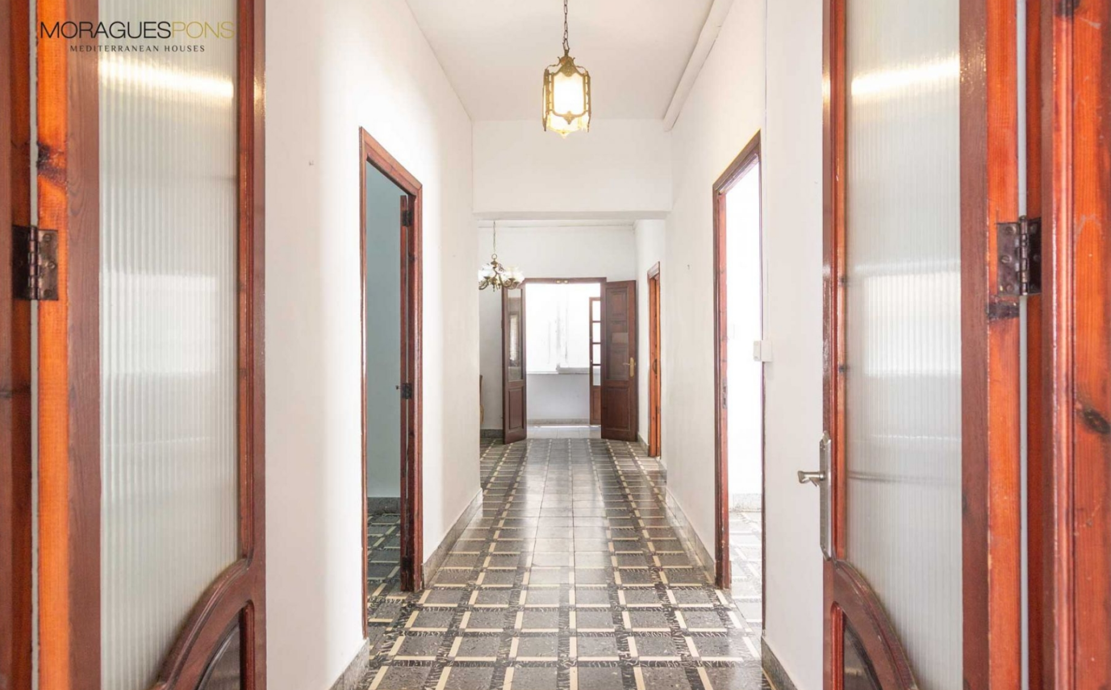
Townhouse in Jávea to renovate OLD TOWN CENTER, JÁVEA/XÀBIA - REF. V-415