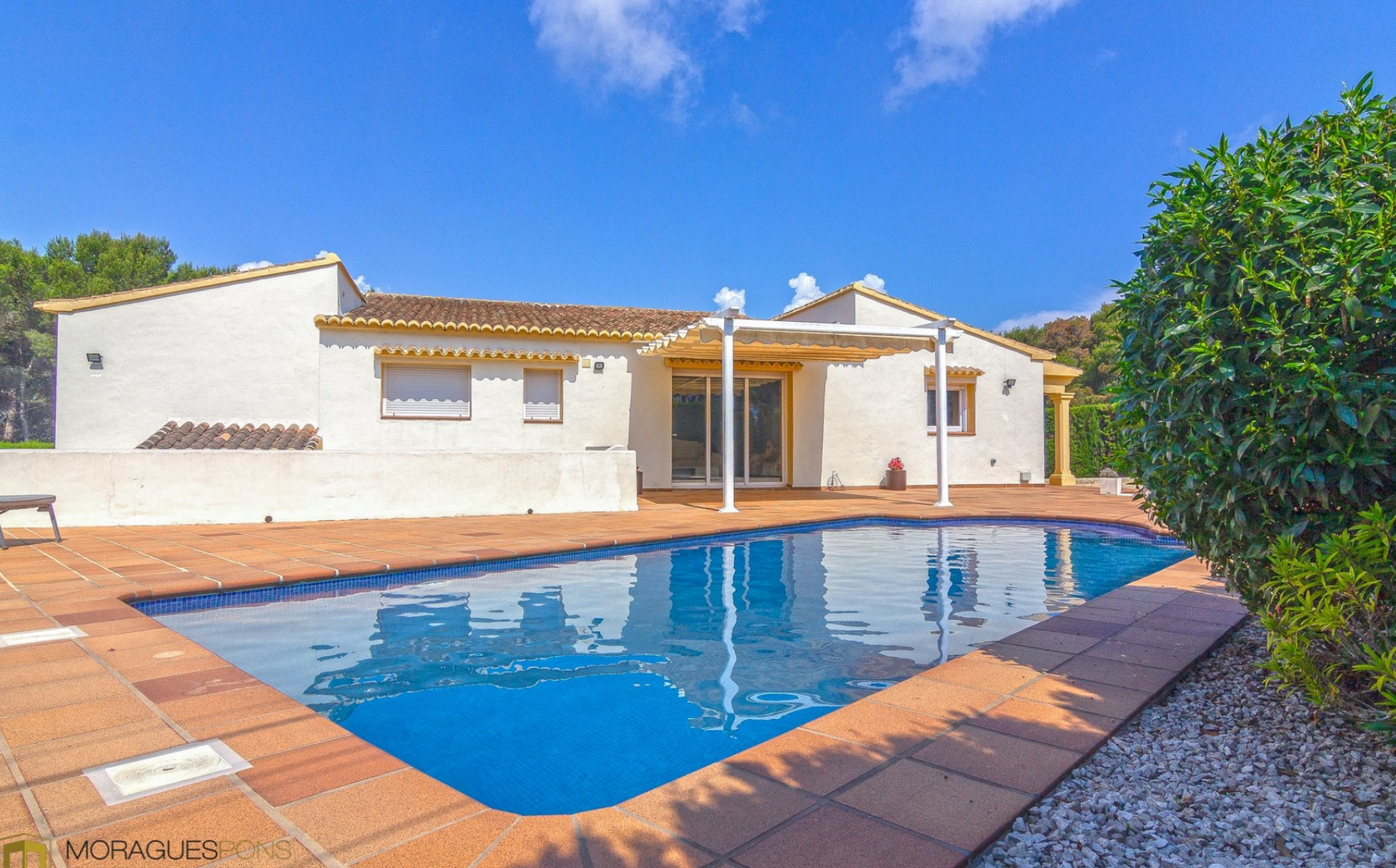
Villa for sale in Balcón al Mar in Jávea JÁVEA/XÀBIA - REF. V-476