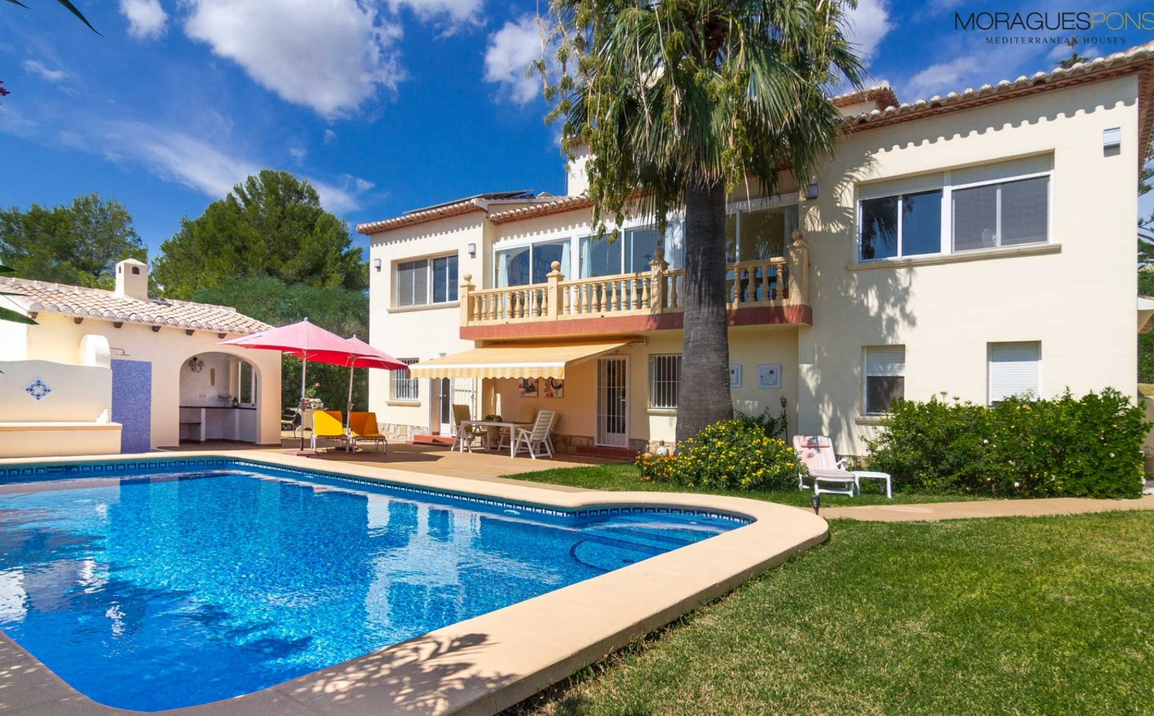
Villa next to Jávea's golf course

PARTIDA COMUNES - ADSUBIA, JÁVEA/XÀBIA - REF. V-312