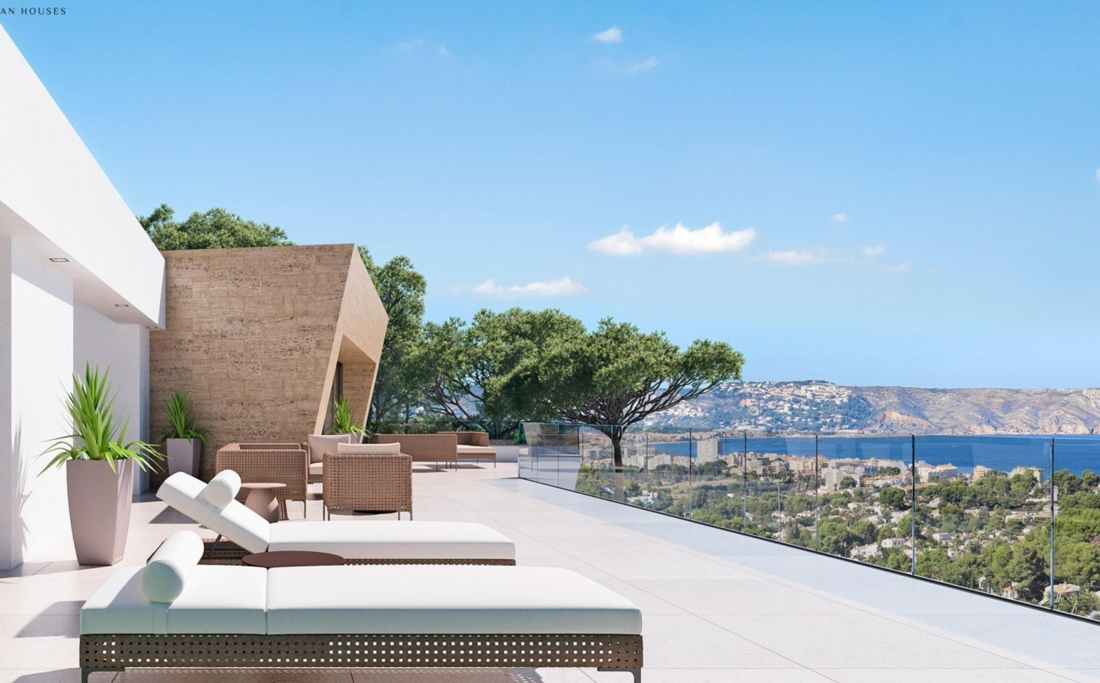
Villa under construction overlooking the bay of Jávea CAP MARTÍ - PINOMAR, JÁVEA/XÀBIA - REF. V-105