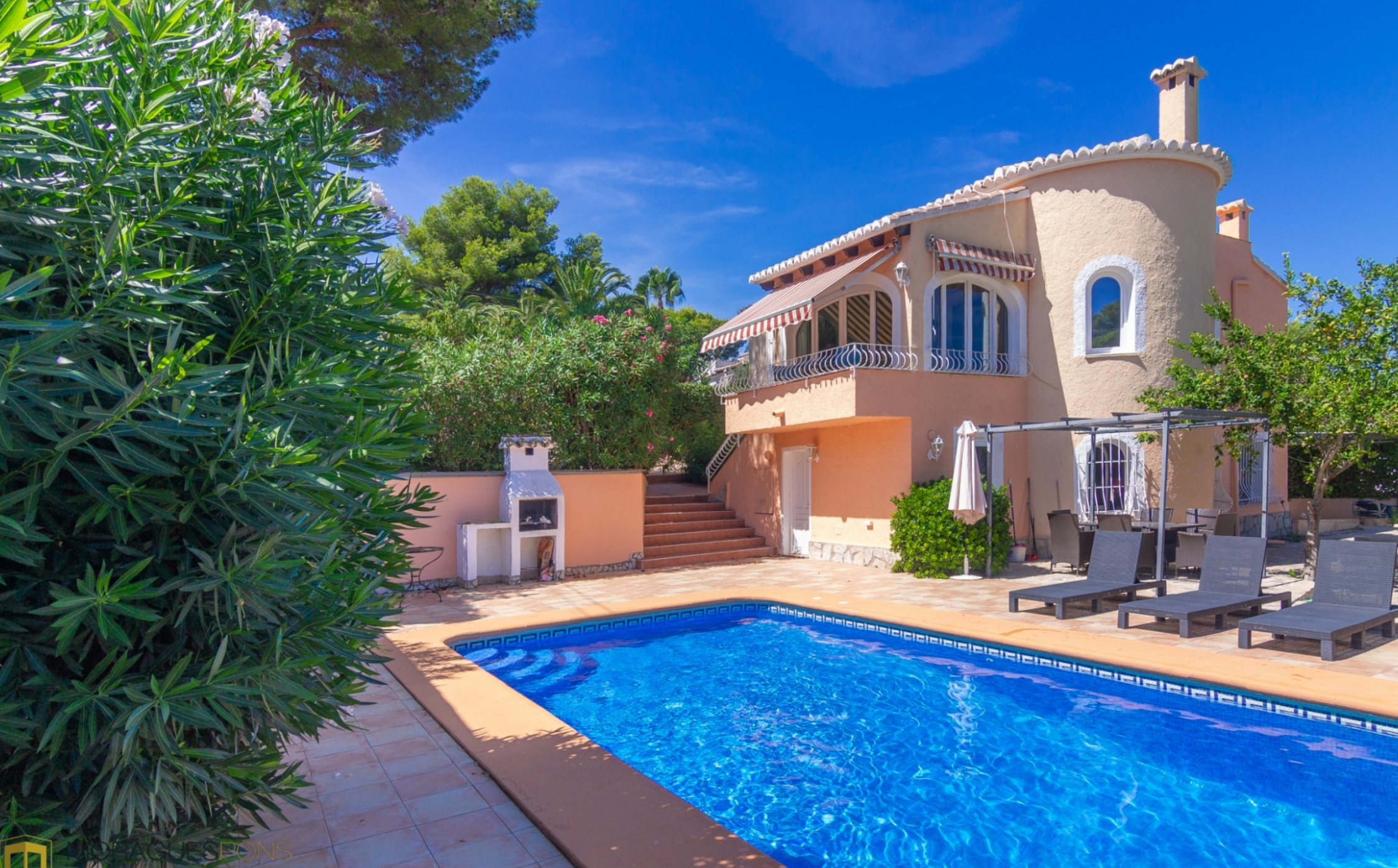
Villa with garden and swimming pool in Jávea CAP MARTÍ - PINOMAR, JÁVEA/XÀBIA - REF. V-474