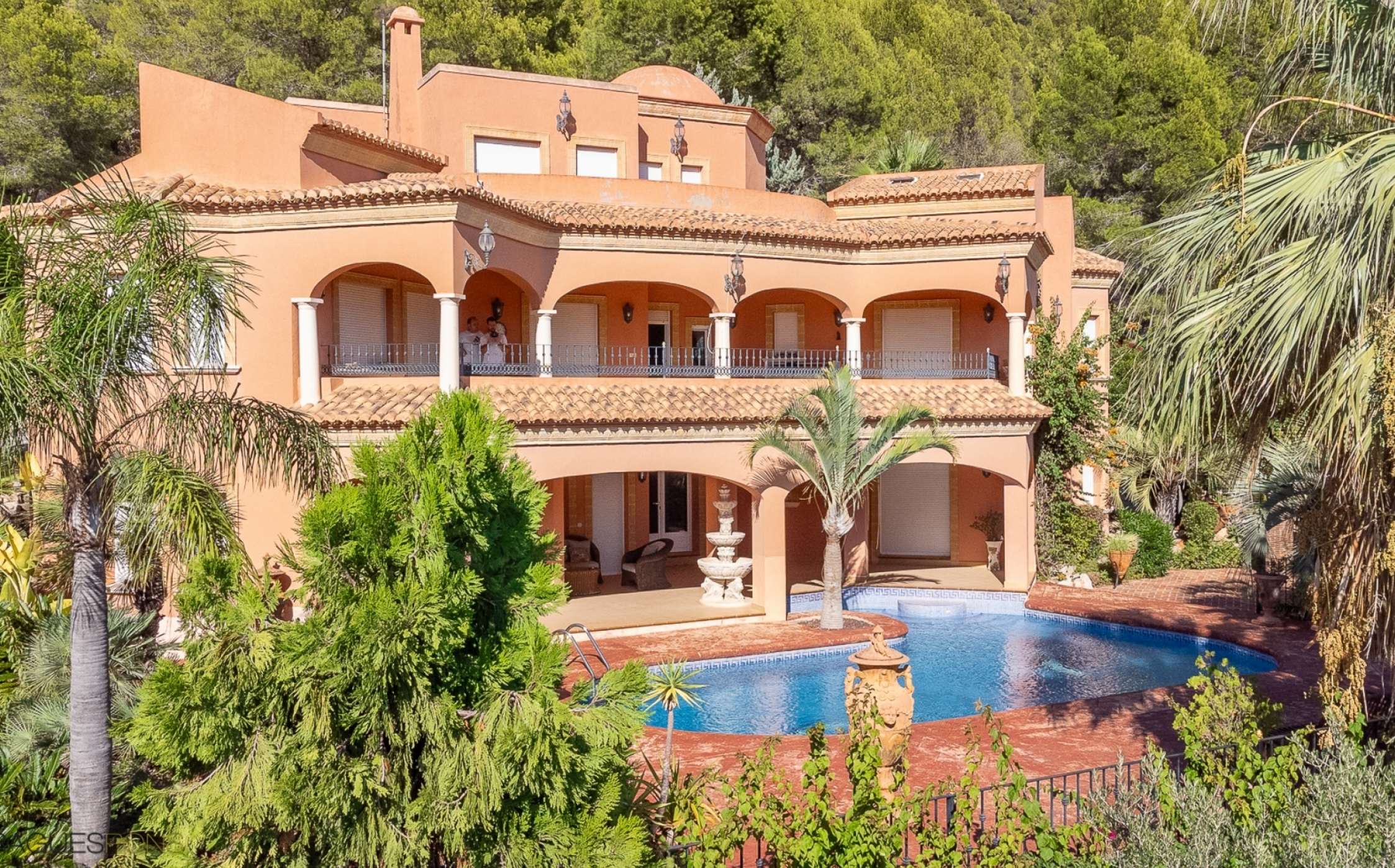
Villa with large plot and open views in Jávea. MONTGÓ - PARTIDA TOSAL, JÁVEA/XÀBIA - REF. V-408