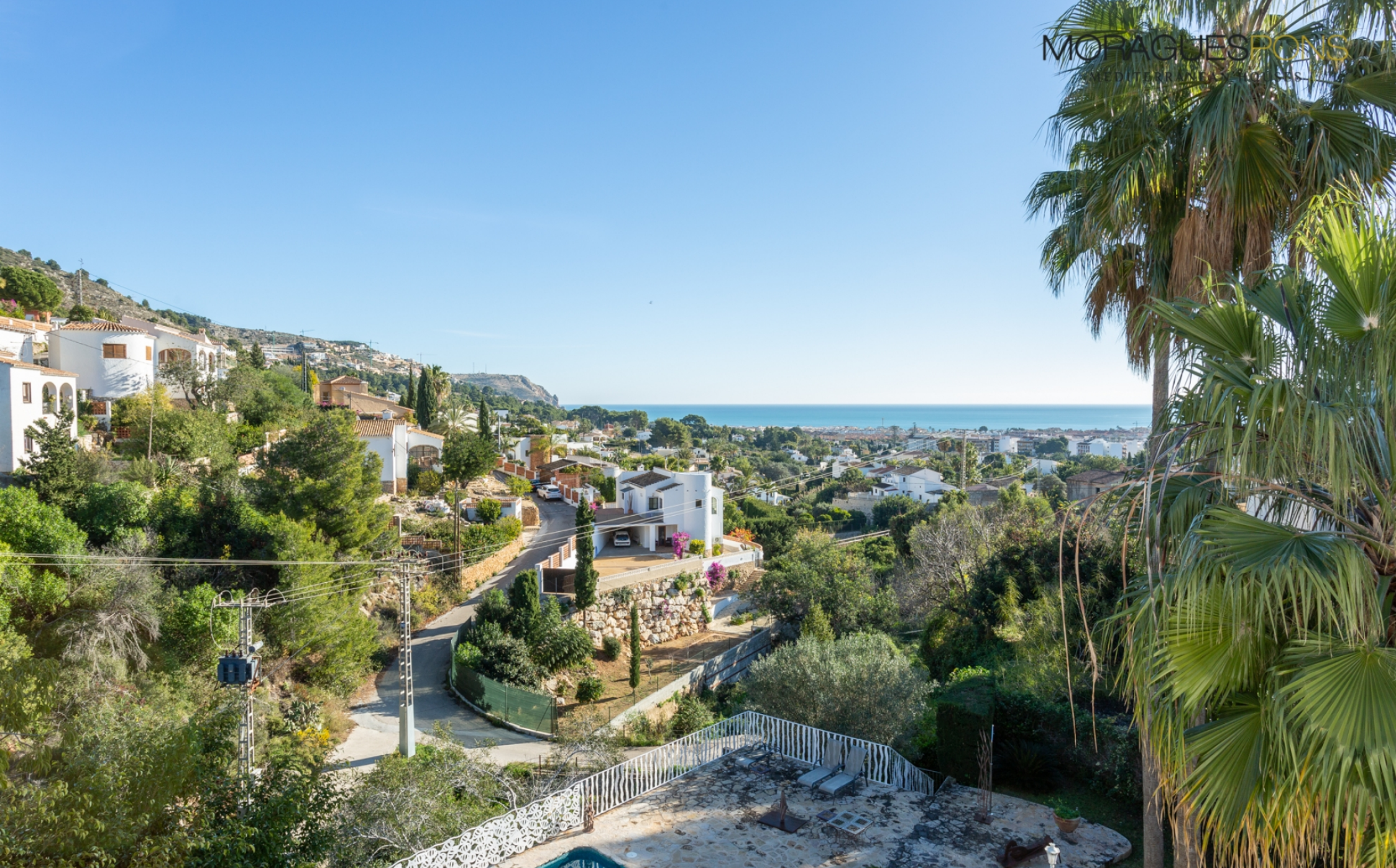
Villa with sea views and large plot in Jávea

CUESTA SAN ANTONIO - PUCHOL, JÁVEA/XÀBIA - REF. V-355