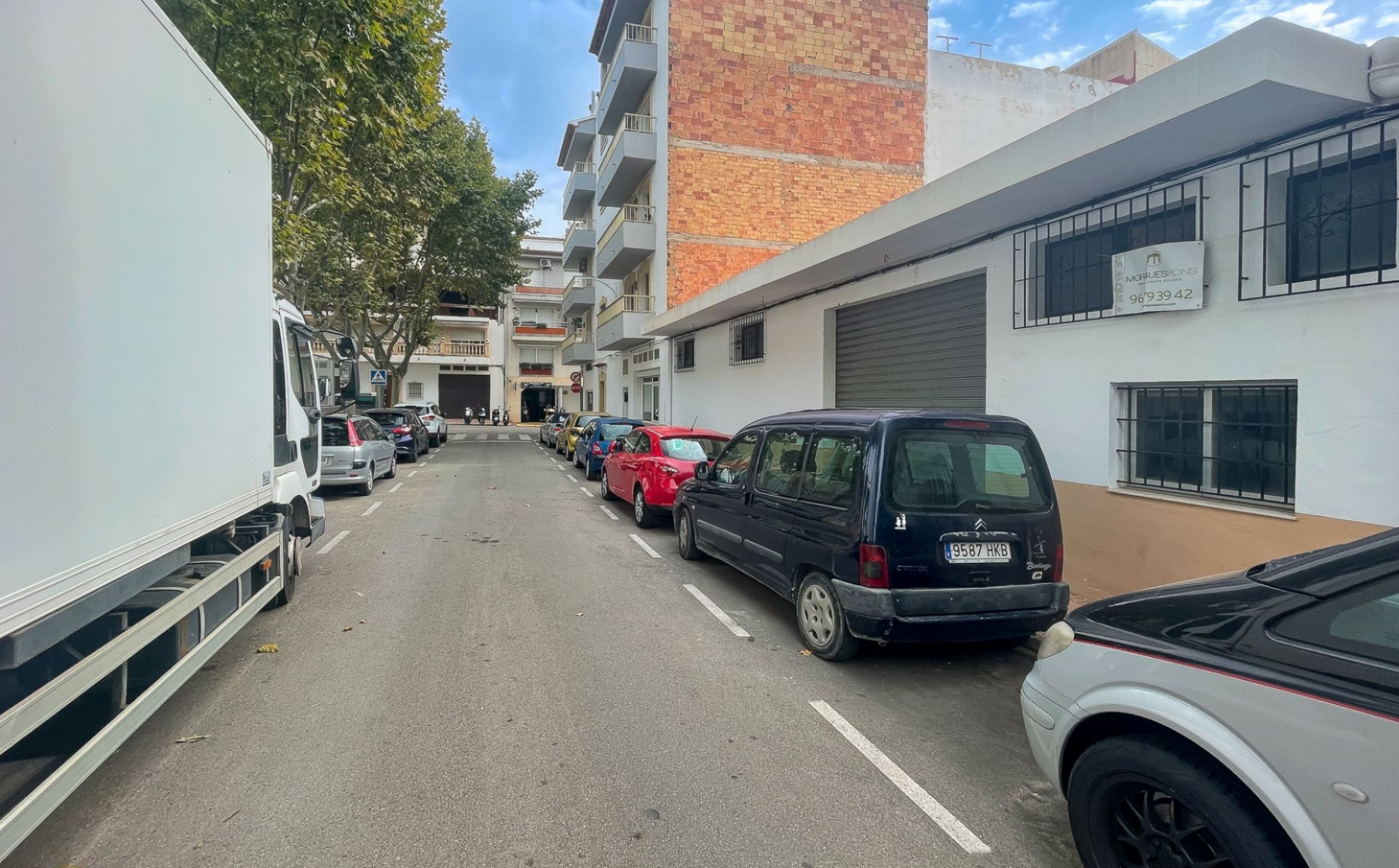
Commercial premises for rent Javea OLD TOWN CENTER, JÁVEA/XÀBIA - REF. LC-116