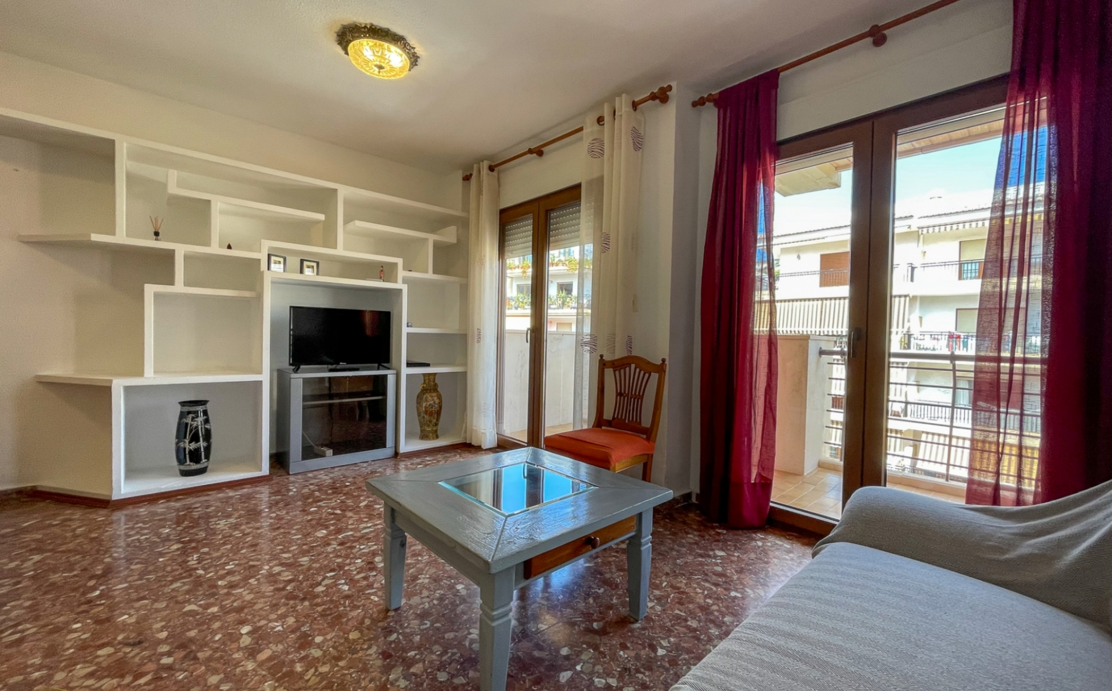
Long term rental in the port of Javea PORT, JÁVEA/XÀBIA - REF. A-600