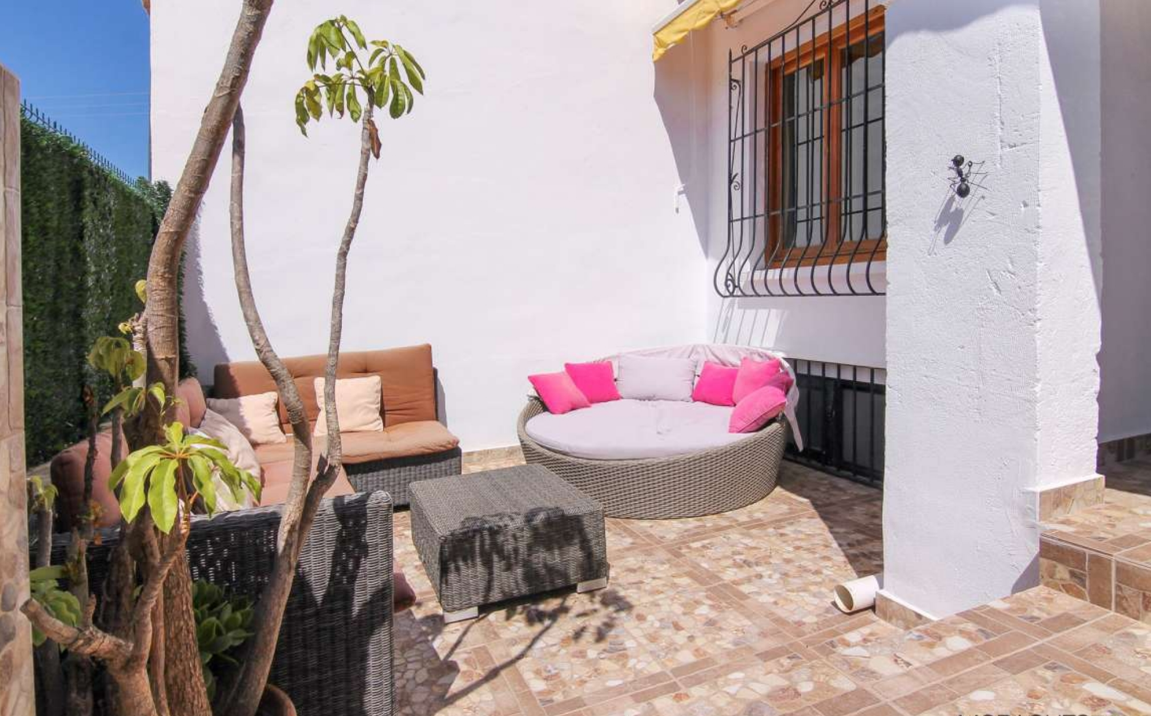
White stone walls Mediterranean this beautiful townhouse in Jávea MONTAÑAR - EL ARENAL, JÁVEA/XÀBIA - REF. V-631