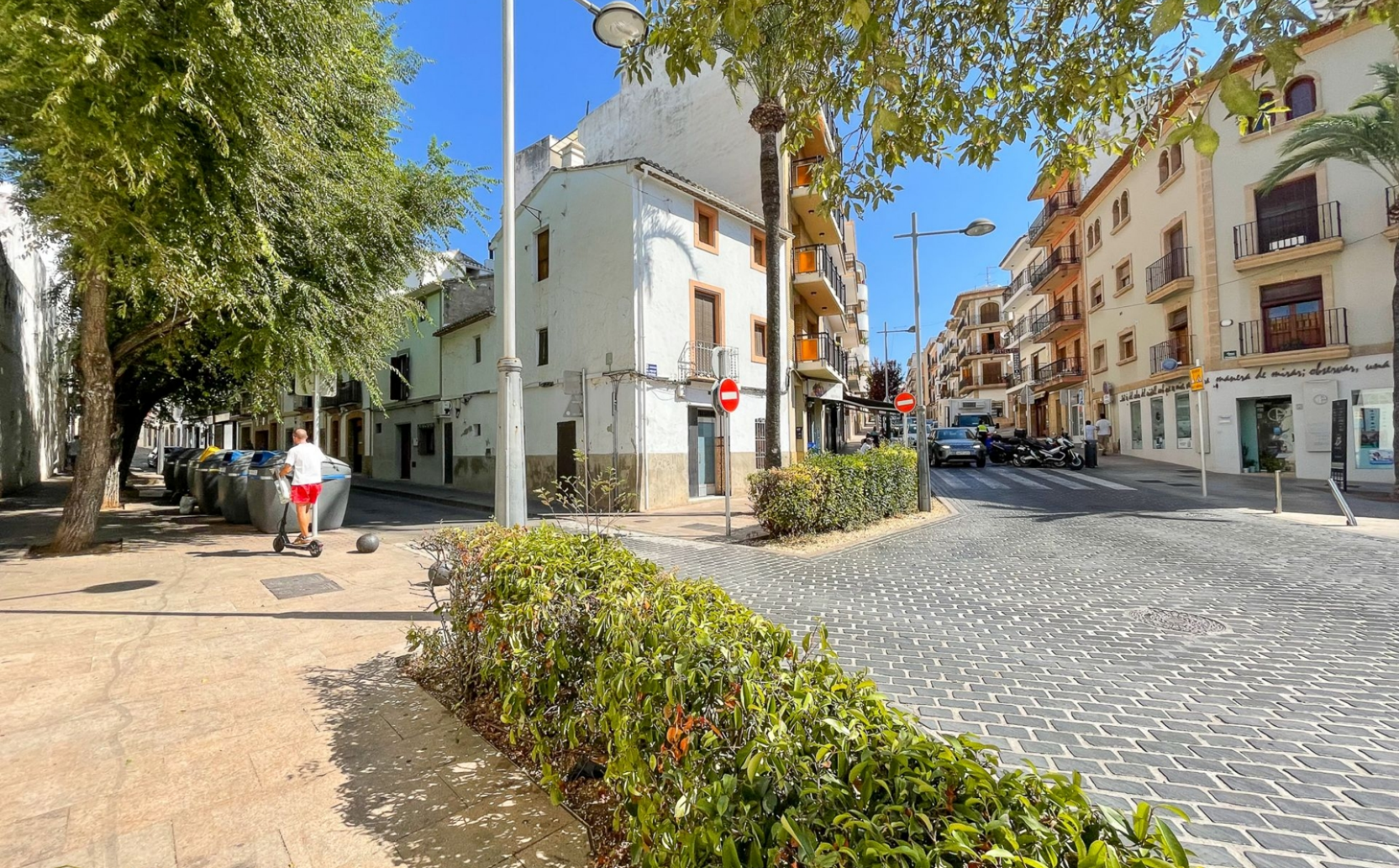
Casa de pueblo para reformar en Jávea centro CENTRO CIUDAD, JÁVEA/XÀBIA - REF. V-426