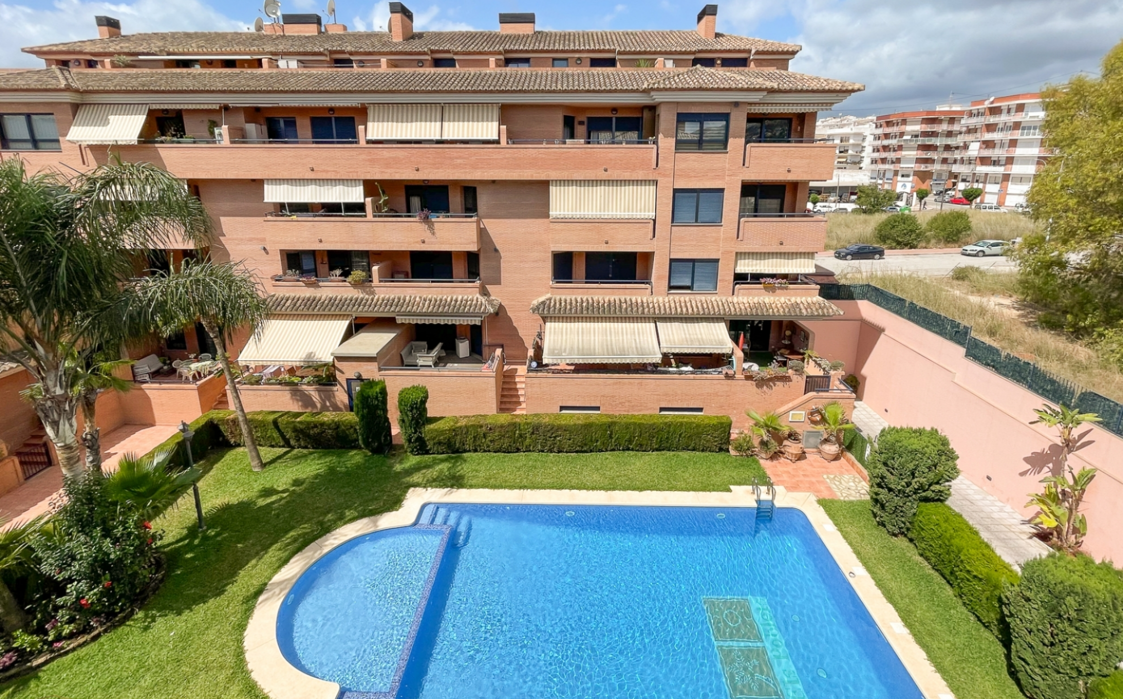
Ático dúplex a la venta en Jávea JÁVEA/XÀBIA - REF. A-455