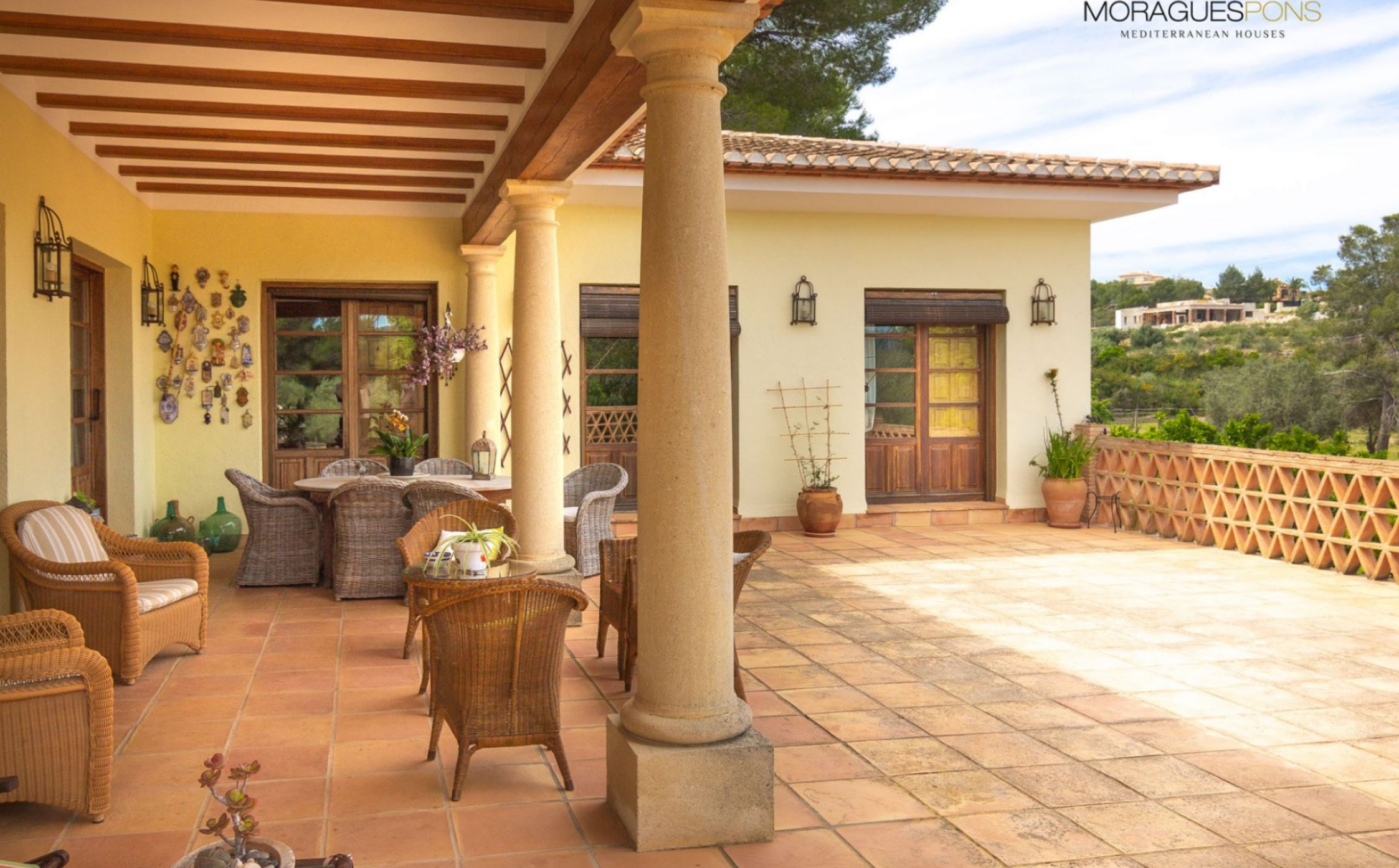
Finca Rústica Yeguada. Jávea.

PARTIDA COMUNES - ADSUBIA, JÁVEA/XÀBIA - REF. V-439